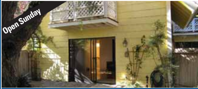
MOUNTAIN VIEW 2BR | 1.5BA

13101 DIERICX AVENUE $1,048,000 Cozy home on a great lot. 3BR/1BA. Living room w/fireplace, formal din area, Galley kitchen w/updated appliances. Double pane windows. Pool. Gene Blinick 650.948.0456