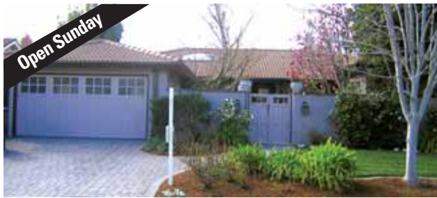
MOUNTAIN VIEW 4BR | 2BA

237 RAINBOW PLACE $605,000 3 BR 3.5 BA Gorgeous! Three master suites & chef's kitchen. Pergo flooring, new carpet & designer paint. Cat 5 wiring. New dual zone air. Peaceful location. Private patio. Shelly Potvin 650.941.7040