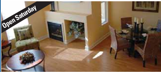
MILPITAS 3BR | 3.5BA

237 RAINBOW PLACE $605,000 3 BR 3.5 BA Gorgeous! Three master suites & chef's kitchen. Pergo flooring, new carpet & designer paint. Cat 5 wiring. New dual zone air. Peaceful location. Private patio. Shelly Potvin 650.941.7040