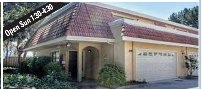
MOUNTAIN VIEW 2BR | 2.5BA