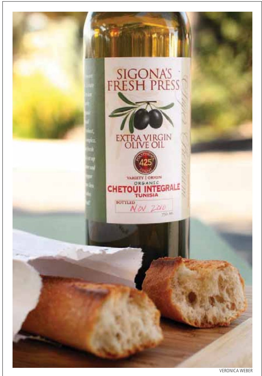
Sigona's Extra Virgin Olive Oil, coupled with a fresh baguette, makes a yummy hostess gift.