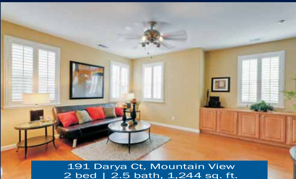
191 Darya Ct, Mountain View 2 bed | 2.5 bath, 1,244 sq. ft. $615,000 Shown by Appointment