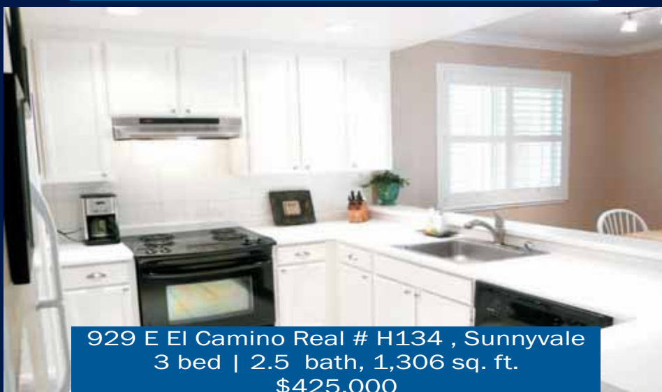
929 E El Camino Real # H134, Sunnyvale 3 bed | 2.5 bath, 1,306 sq. ft. $425,000 Open Sat & Sun, 1:30 pm-4:30 pm