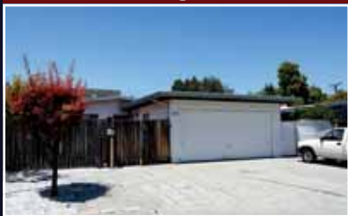
2529 Mardell St., Mountain View