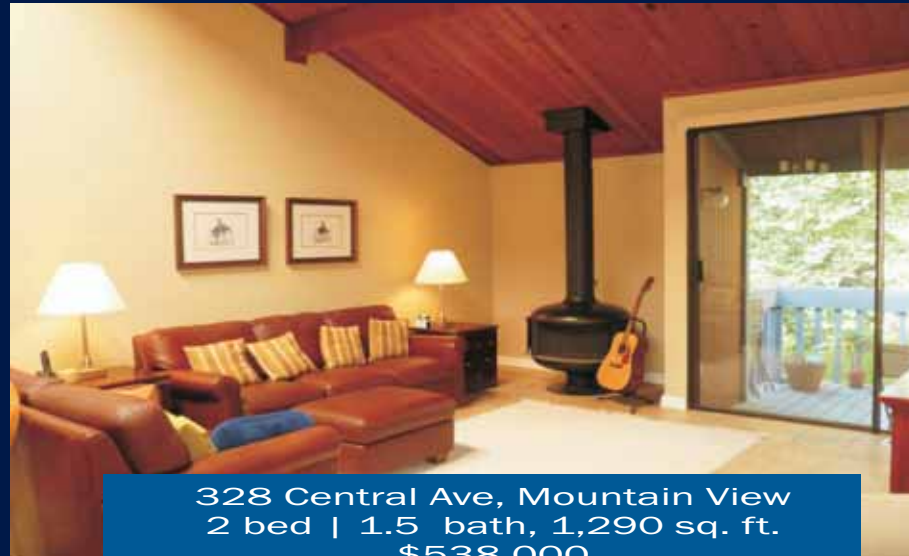
328 Central Ave, Mountain View 2 bed | 1.5 bath, 1,290 sq. ft. $538,000 Open Sunday, 1:30 pm-4:30 pm