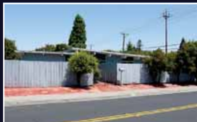
2400 Alvin St., Mountain View Offered at $599,000