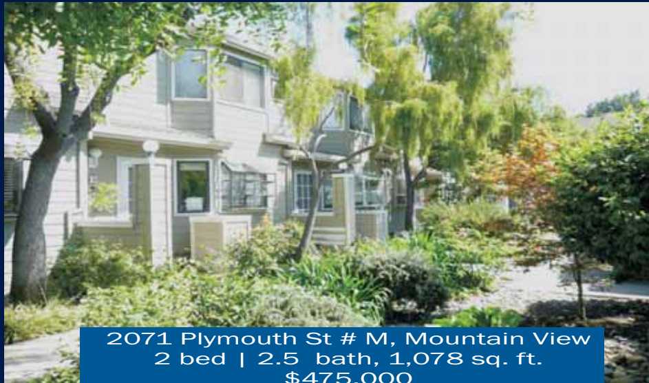
2071 Plymouth St # M, Mountain View 2 bed | 2.5 bath, 1,078 sq. ft. $475,000 Open Sunday, 1:30 pm-4:00 pm

Your Condo & Townhome Specialist since 1990