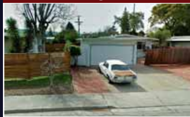
2455 Elka Ave., Mountain View

"Put my energy, business experience, real estate expertise to use today for all your home buying and selling needs."