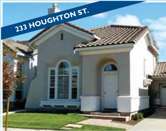
233 HOUGHTON ST.