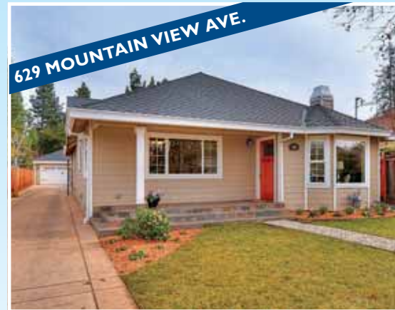
629 MOUNTAIN VIEW AVE.