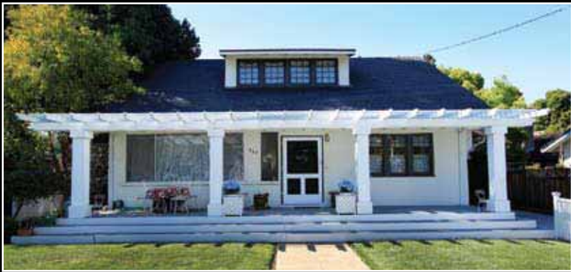
Rare & amazing opportunity in downtown Mountain View.