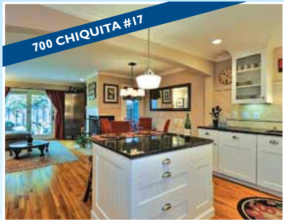
700 CHIQUITA #17