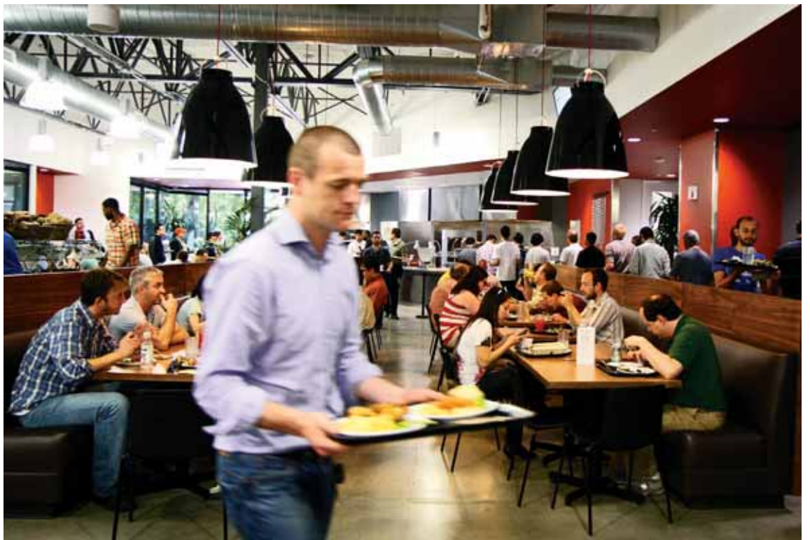
Googlers gather for lunch at the Blaze Cafe on Google's campus on April 20.