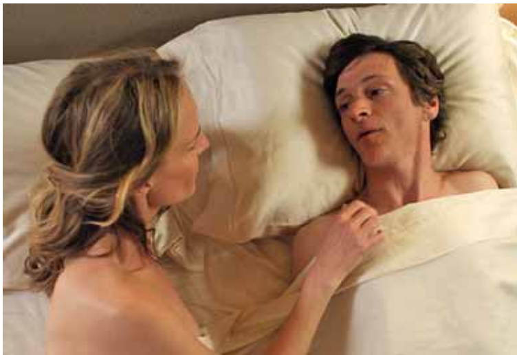
Helen Hunt and John Hawkes in "The Sessions."