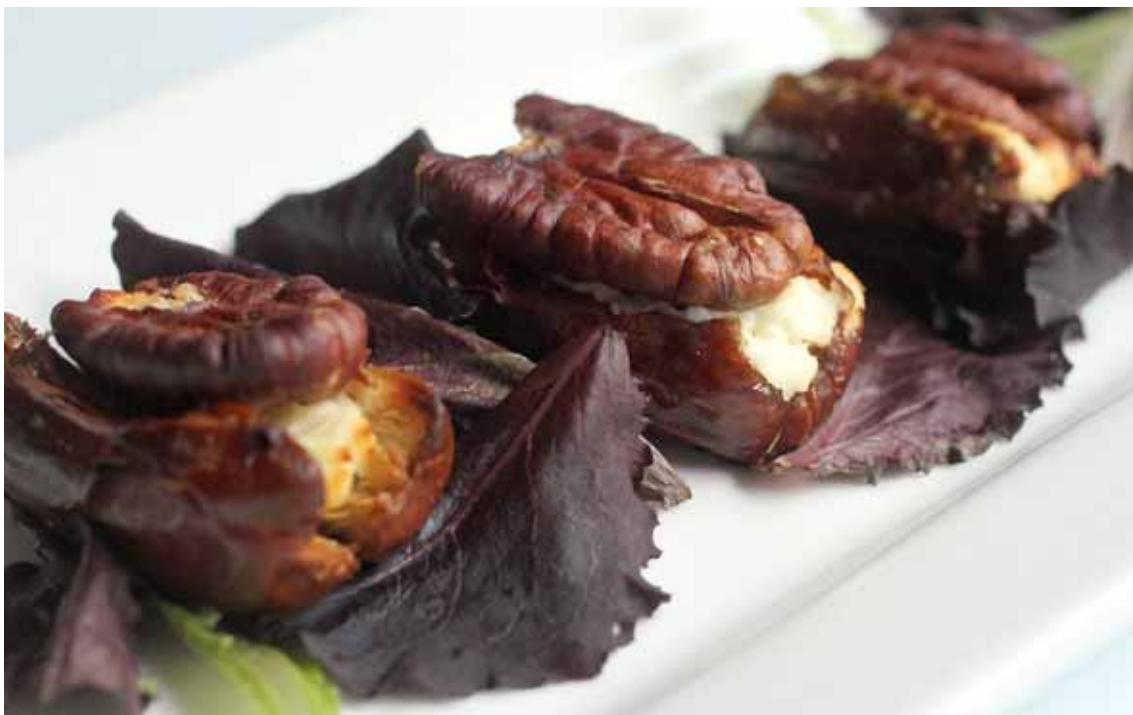
Above, from top: Vino Locale's Mediterranean plate, with Castelvetrano olives and cured meats; the pulled pork sliders; warm dates stuffed with goat cheese.