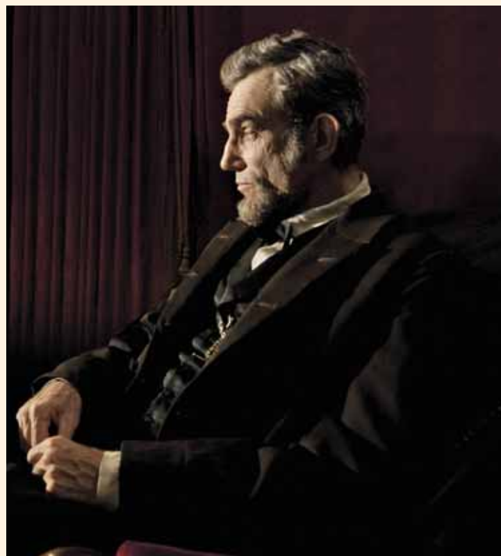
Daniel Day-Lewis in "Lincoln."

(Century 16, Century 20) It's not easy being 9 feet tall and 643 pounds. And that's not even the hardest part about being "Wreck-It Ralph," the leading character of Walt Dis-