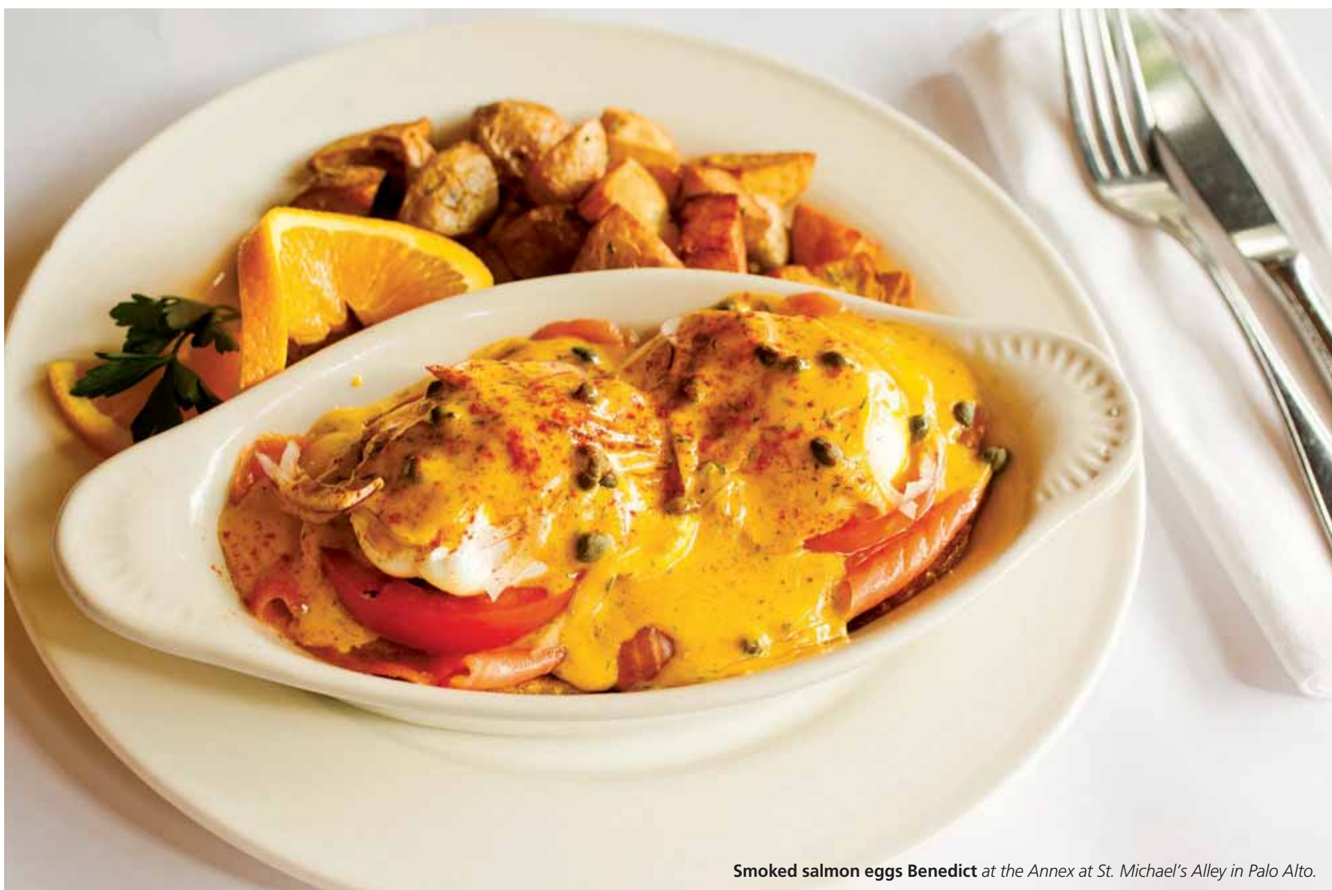
Smoked salmon eggs Benedict at the Annex at St. Michael's Alley in Palo Alto.