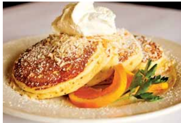
Macadamia nut pancakes come with toasted coconut shavings and a dollop of cream.