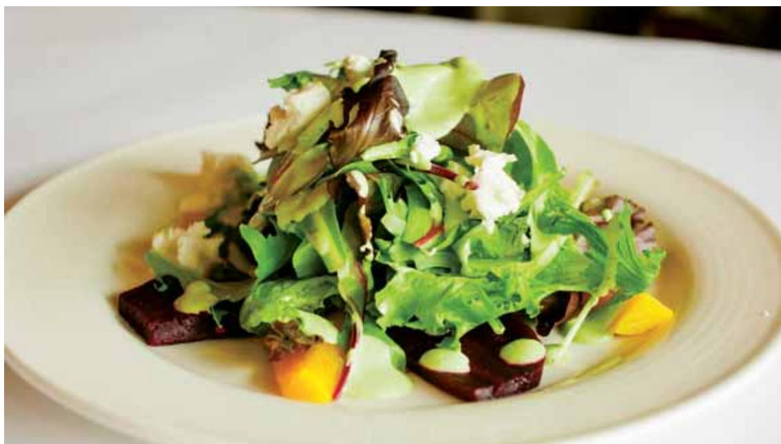
Organic baby greens are the base of a salad with roasted beets, goat cheese and green goddess dressing at the Annex.

There's an egg dish to please every taste, from two eggs any style