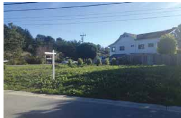
MOSS BEACH $130,000

440 Cesano Court, Unit 210 | 3bd/2ba Patrice Horvath | 650.941.1111