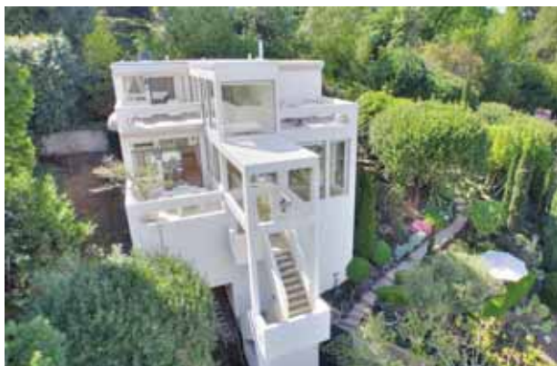
PORTOLA VALLEY $1,695,000

27 Woodhill Drive | 3bd/2.5ba Cindy Bogard O'Gorman | 650.941.1111