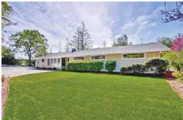
LOS ALTOS HILLS $2,398,000

28266 Christopher Lane | 4bd/3.5ba Tom Correia | 650.941.1111