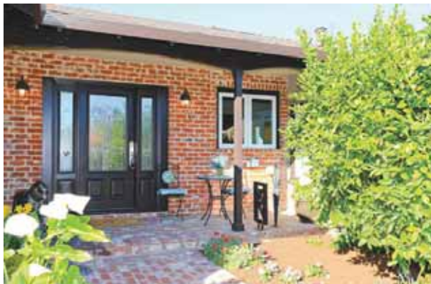
MOUNTAIN VIEW $2,195,000

28266 Christopher Lane | 4bd/3.5ba Tom Correia | 650.941.1111