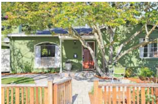
MOUNTAIN VIEW $1,395,000

833 Springfield Terrace | 3bd/2.ba Angie Galatolo | 650.941.1111