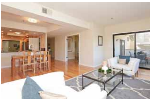
PALO ALTO $1,198,000