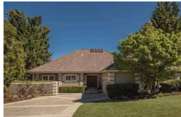
REDWOOD CITY $1,995,000

1208 Awalt Drive | 3bd/2ba Dottie Monroe | 650.941.1111