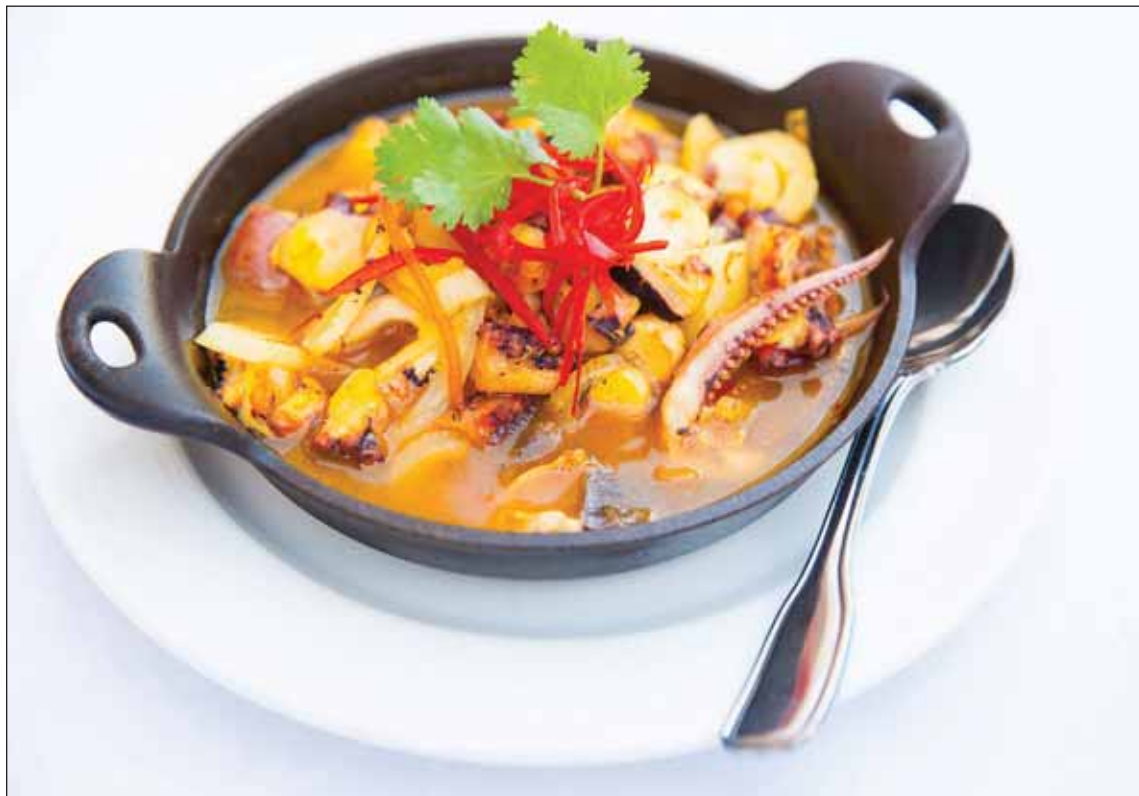
Voya's octopus and calamari skillet "stew" includes baby potatoes, fennel and rocoto chiles in a garlic and saffron broth.

being encased in a fried batter, it is coated in a tomato-oregano sauce and stuffed with rice, corn, arugula and not quite enough mozzarella, invoking a decent risotto filling.