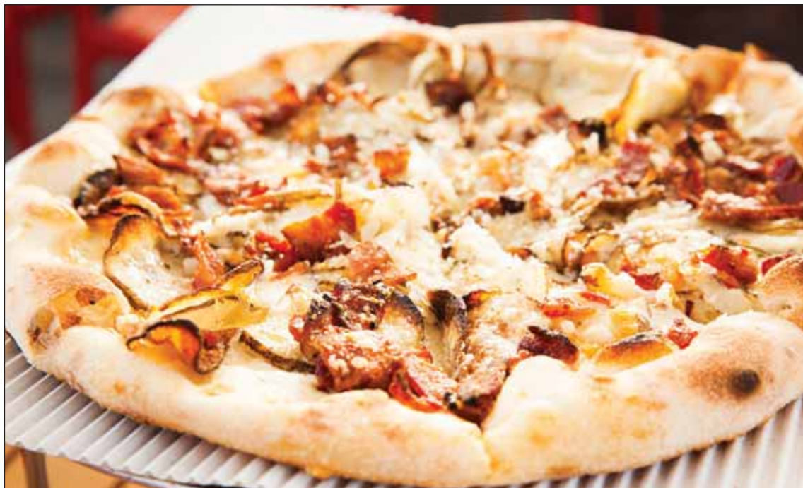
Howie's baked-potato pizza is made with scalloped potatoes, Gruyere cheese, bacon and fresh rosemary.