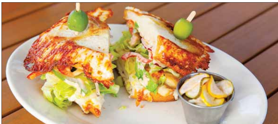
The chicken chipotle melt comes with mozzarella, smoked jalapeño mayonnaise, lettuce, red onions, peppers and cilantro on an Acme baguette.

rior is industrial with exposed beams, sturdy wood tables and chairs as well as a bar area with metal bar stools.