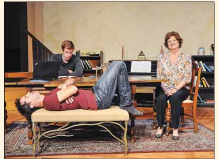
'Tribes' The Pear Theatre will stage "Tribes" by Nina Raine, a drama about a deaf young man, who has always relied on lip-reading, and a young woman who teaches him to connect through sign language. Nov. 5-Nov. 22, Thursday-Saturday, 8 p.m.; Sunday, 2 p.m. $10-$35. Pear Theatre, 1110 La Avenida St., Mountain View. thepear.org/plays/tribes-2