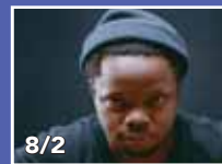
8/2 Ambrose Akinmusire & Friends