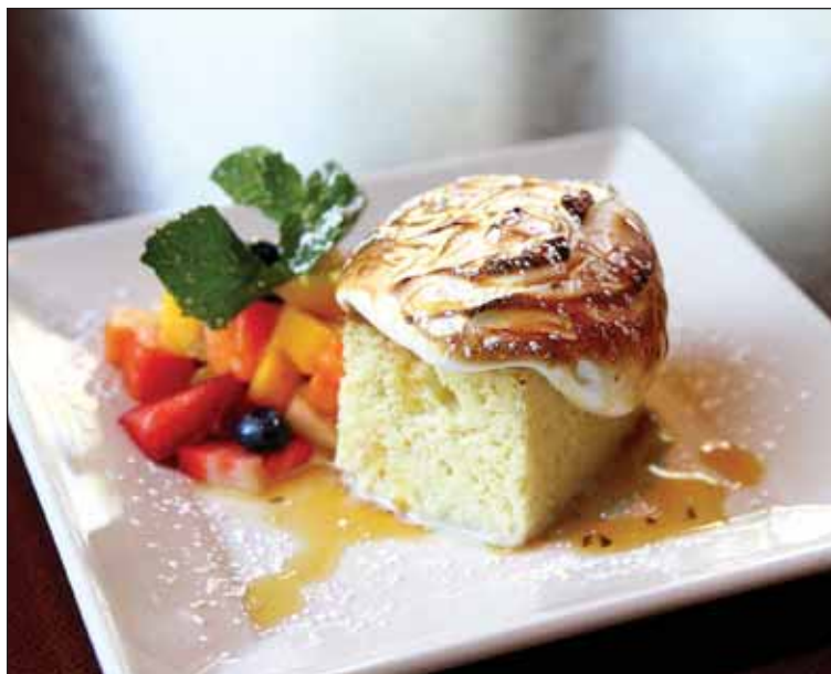
Cascal's take on the classic tres leches cake includes an infusion of coconut and a meringue topping.