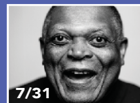
7/31 Billy Hart Quartet