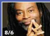
8/6 Bobby McFerrin Meets SJW

6/18 8 PM Bing Concert Hall Stanford University