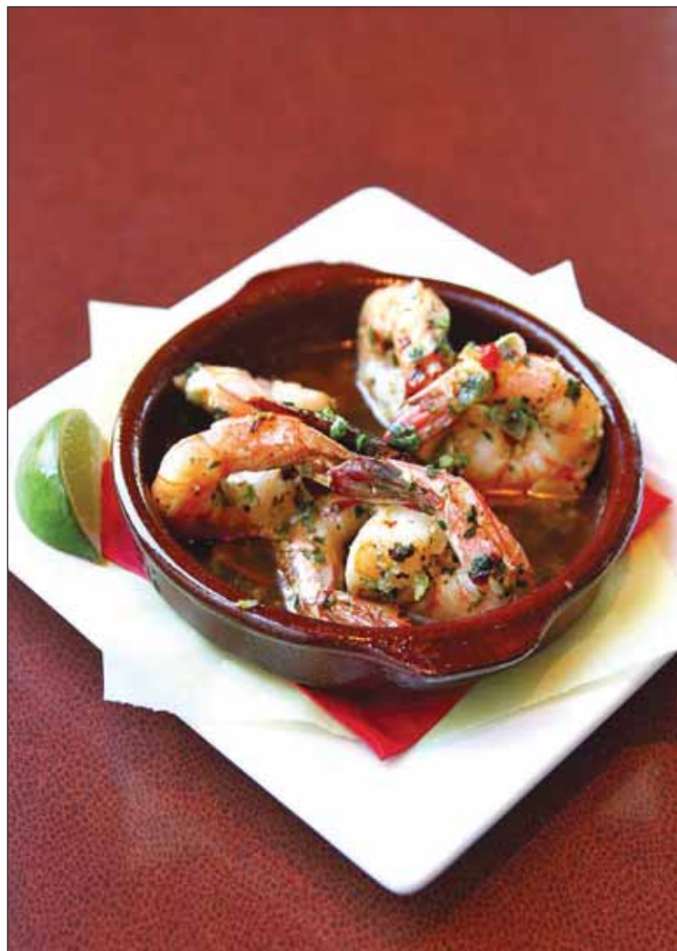
Sizzling shrimp, one of the small-plate tapas on the menu, has a chile-infused kick.

My favorite dish was the corn-poblano sauté with crisp serrano ham ($10.50). Fresh white corn, poblano chilies, red onions, cotija cheese (a hard and crumbly cow's milk from Mexico) and crema were served like a deep-dish casserole. Unlike a casserole though, the flavors didn't meld together. They were distinct as were the textures: creamy, crisp, moist and chewy. The dish was enticing, with plenty to share — though I didn't want to. The dozen bivalves served in the mussels pimentón ($14) were prepared in a smoky, paprika-infused wine-butter sauce. It was worth saving some of the bread from the complimenta-