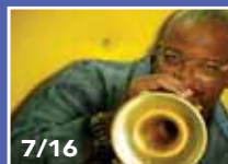
7/16 Terence Blanchard & the E-Collective