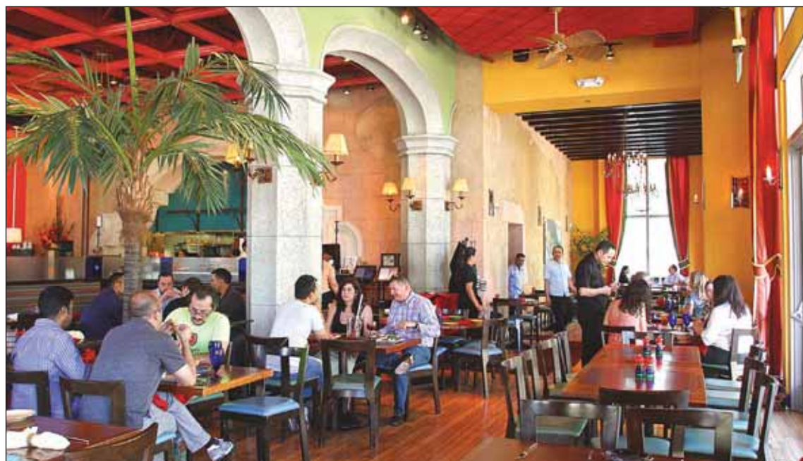
Cascal's airy main dining room features vibrantly colored décor.

169 STATE ST. @ 3RD LOS ALTOS, CA 650-941-2610