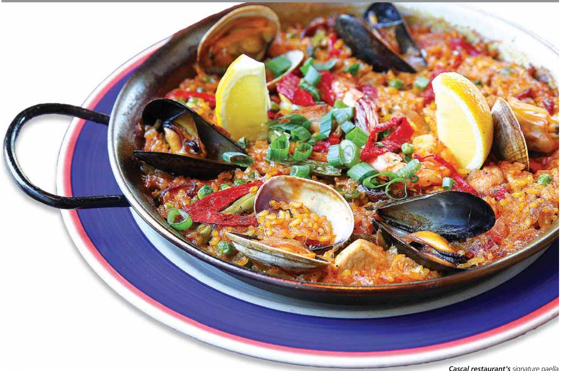
Cascal restaurant's signature paella serves up pork, chicken, shrimp, mussels, clams and chorizo in saffron-infused rice.