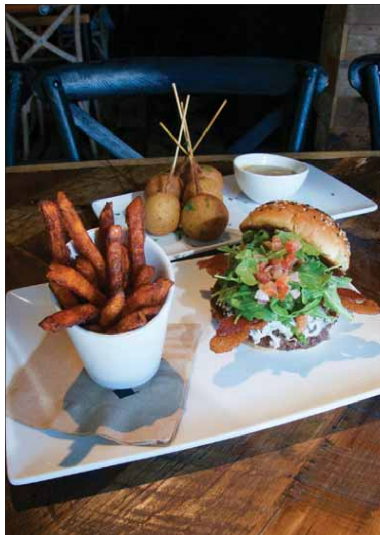
Clockwise from left: Sweet potato fries, lollipop corn dogs and the Fresno fig burger.

The five fat lollipop corn dogs ($8) were more showy than delectable. The Polish sausage, embedded in too much sweet-corn batter, had