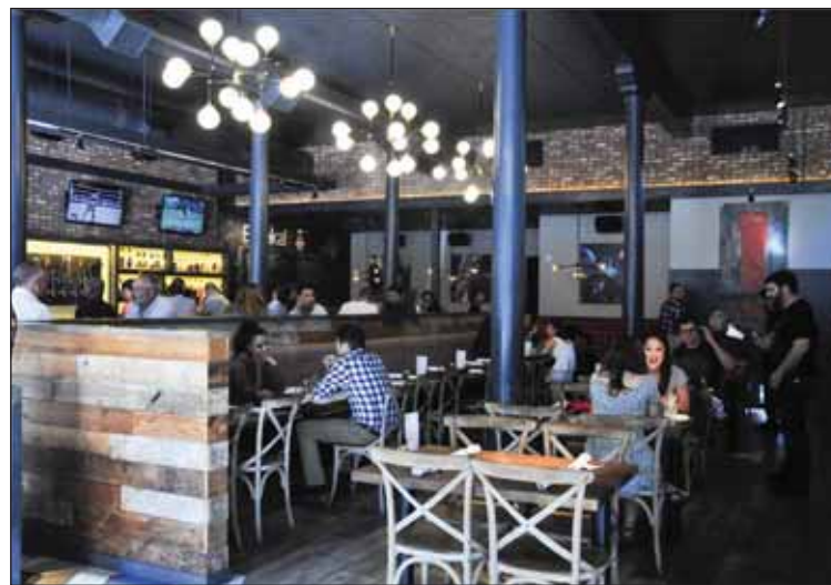
Eureka! restaurant is housed in a century-old building at 191 Castro St.

The wall behind the bar displays an impressive array of tap handles and backlit glass shelves of whiskeys. The 50 small-batch whiskey count is impressive, but the 40 craft beers on tap — 20 that rotate, 20 that are always available — are the backbone of Eureka!'s beverage business. The all-