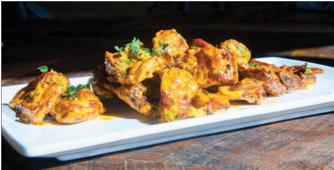
Slow-roasted pork ribs are slathered in orange chili sauce at Eureka! in Mountain View.

almost no flavor, but corn dogs generally don't have much flavor. The slightly spicy porter mustard was the saving grace. The dogs were more exciting on the plate than in the mouth.