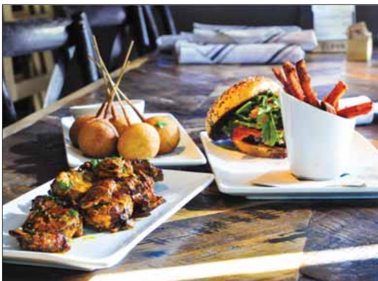
Eureka! fills its menu with all-American classics with a local twist.