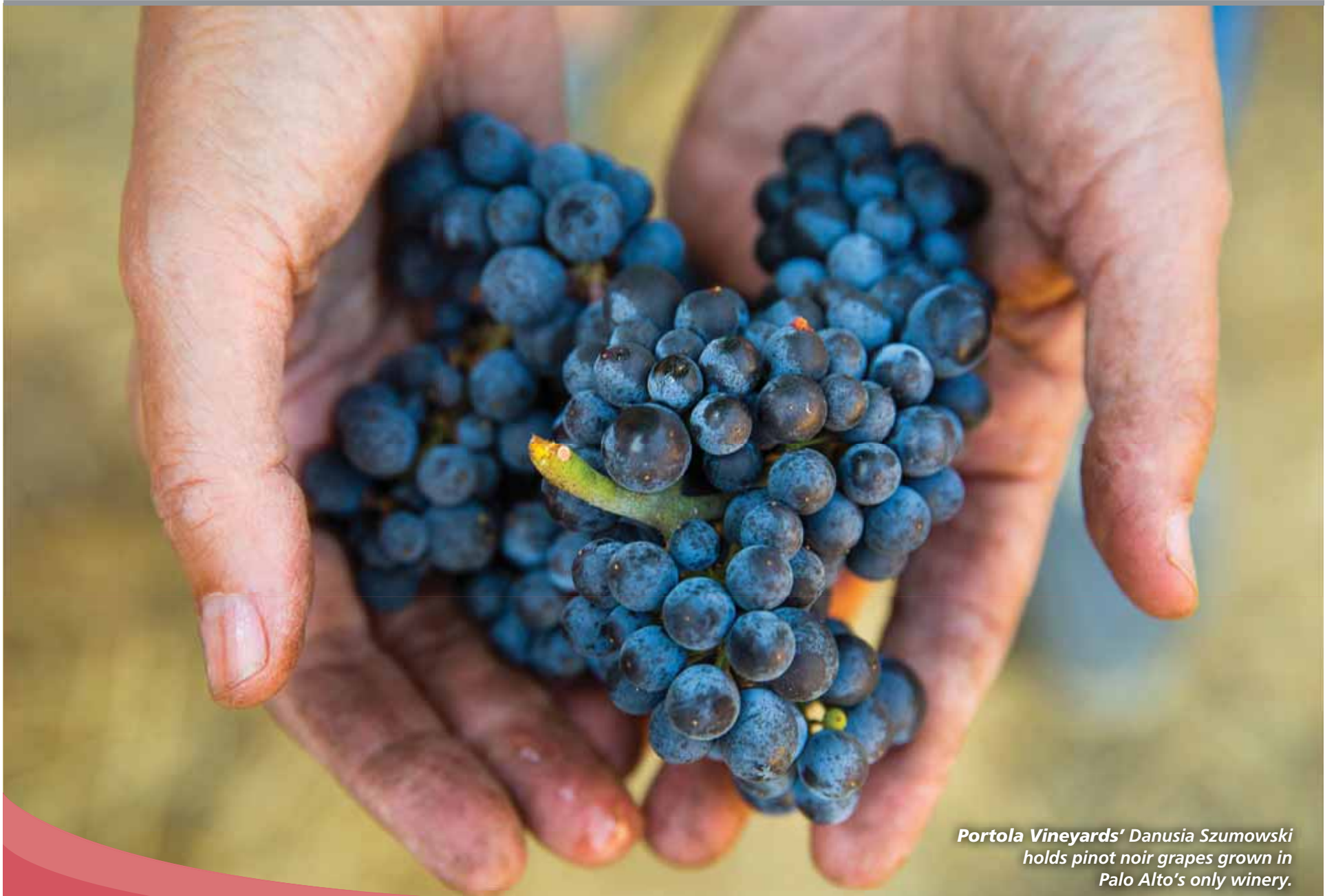
Portola Vineyards' Danusia Szumowski holds pinot noir grapes grown in Palo Alto's only winery.