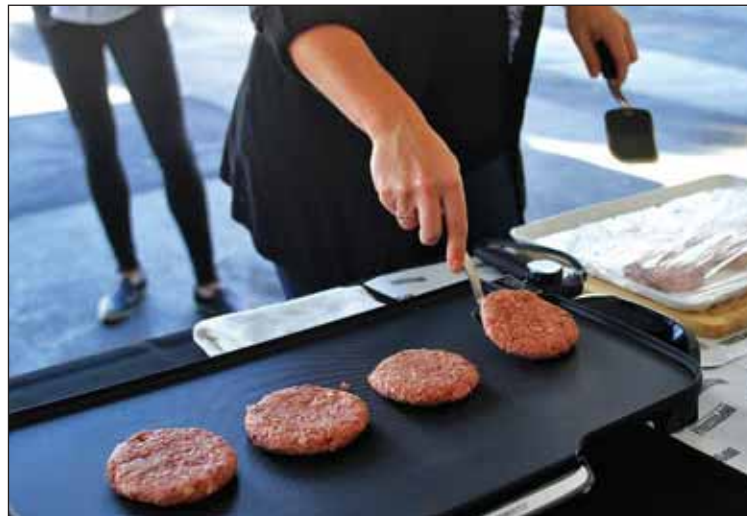
Impossible Foods plant-based burgers on the grill.

Though it may be a while before the Impossible Burger’s ground beef is available at your local grocery store, the scientists continue to push the boundaries of the impossible as they look to re-create other meat, fish and dairy products in the most scalable, environmentally conscious and nutritious way. ▣