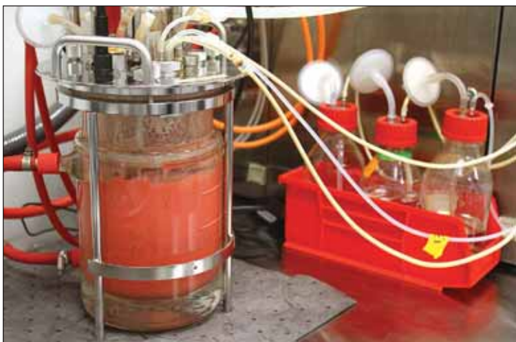
A small batch of fermented yeast (seen at left) is processed at the pilot plant at Impossible Foods, where scientists work to extract heme.