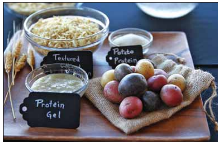
Textured wheat and potato proteins form the vegetable base of the Impossible Burger.