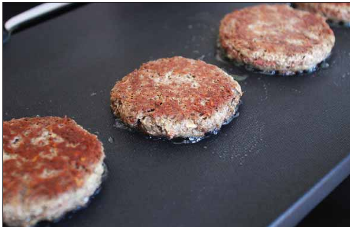
Burgers made by Impossible Foods sizzle on the grill at the company's headquarters in Redwood City.