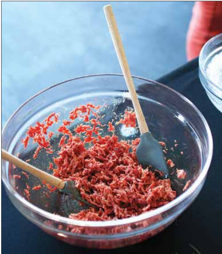
The Impossible Burger in its raw form reveals the blood-red color of the burger's signature ingredient, heme, a protein that gives ground beef burgers their signature taste, yet also exists in plants. Impossible Foods extracts heme from fermented yeast.

Celeste Holz-Schietinger, Impossible Foods' principal scientist, demonstrated assembling a burger, which the company chose as its flagship product.