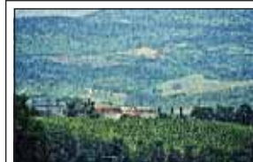
Authentic Italian Villa www.selvamica.com