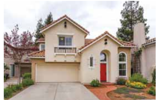
MOUNTAIN VIEW $1,920,000

2058 Edgewood Drive | 4bd/2ba Jim & Jimmy Nappo | 650.941.1111