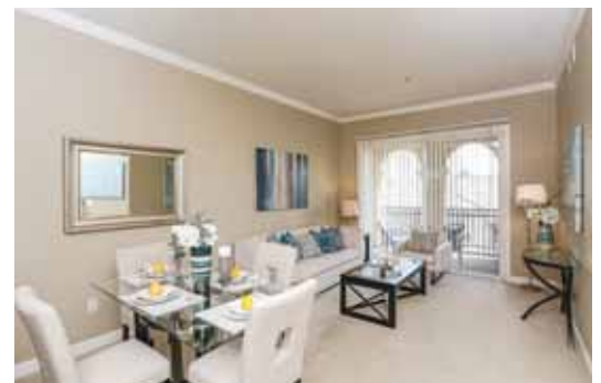
SANTA CLARA $725,000