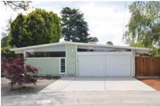
PALO ALTO $2,595,000