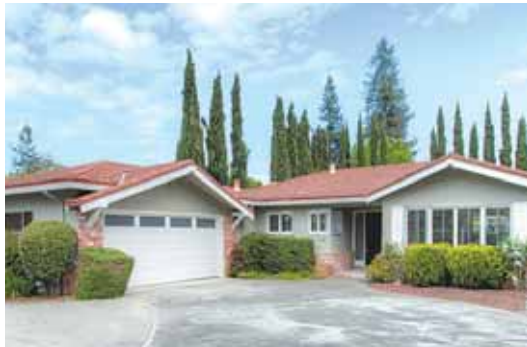
LOS ALTOS $2,650,000

831 Los Altos Avenue | 3bd/2ba Barbara Williams | 650.941.1111