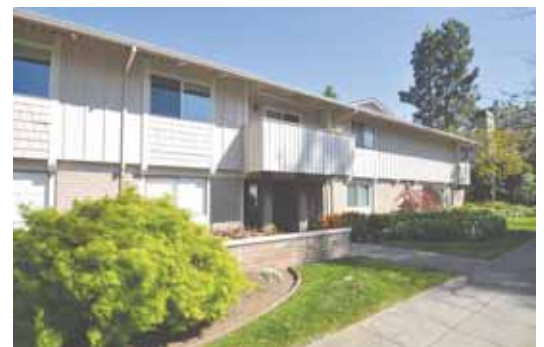
LOS ALTOS $1,350,000

1 West Edith, Unit B111 | 2bd/2ba Patti Robison & Ursula Cremona | 650.941.1111