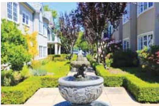
LOS ALTOS $1,500,000

494 Novato Avenue | 4bd/3ba Michael Galli | 650.941.1111