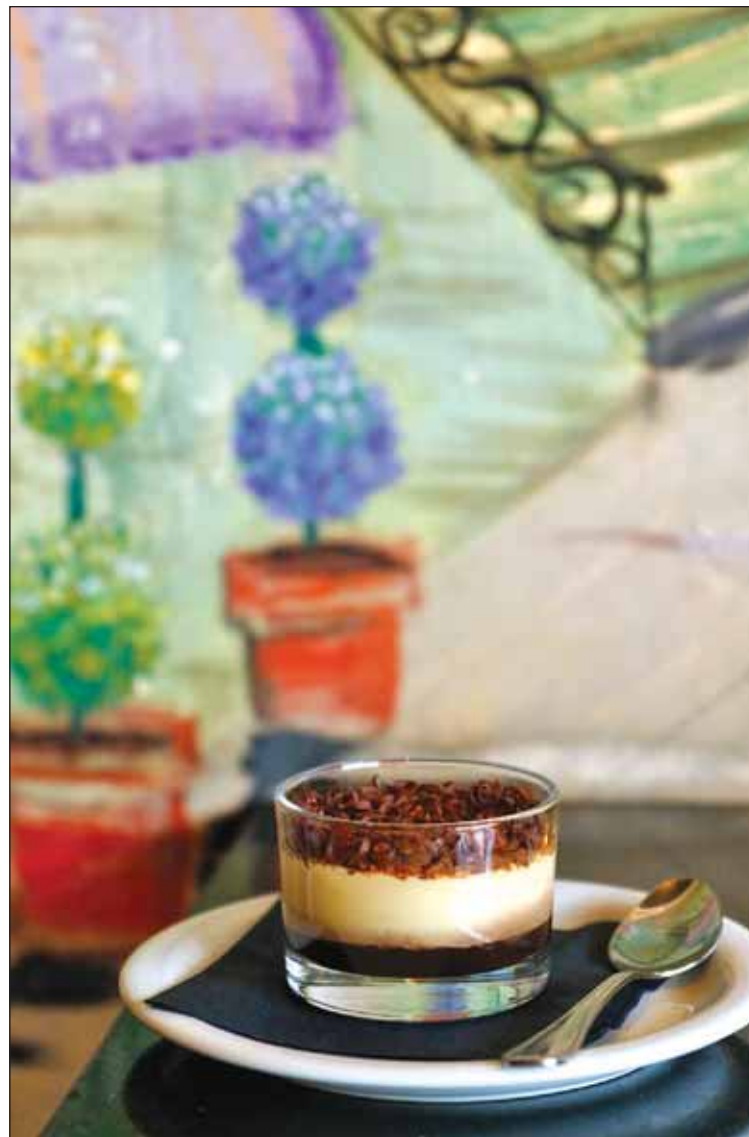
Coppa mascarpone, a dessert imported from Italy, layers chocolate cream and mascarpone cheese with chocolate shavings and amaretto cookie crumbs.