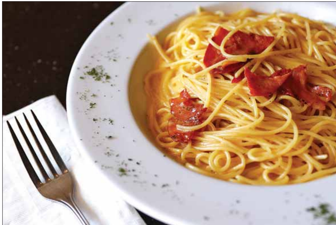
Napoletana's spaghetti alla carbonara, tossed with pancetta, eggs and Parmesan cheese, transforms simple ingredients into a bowl of pasta with a savory, creamy sauce.