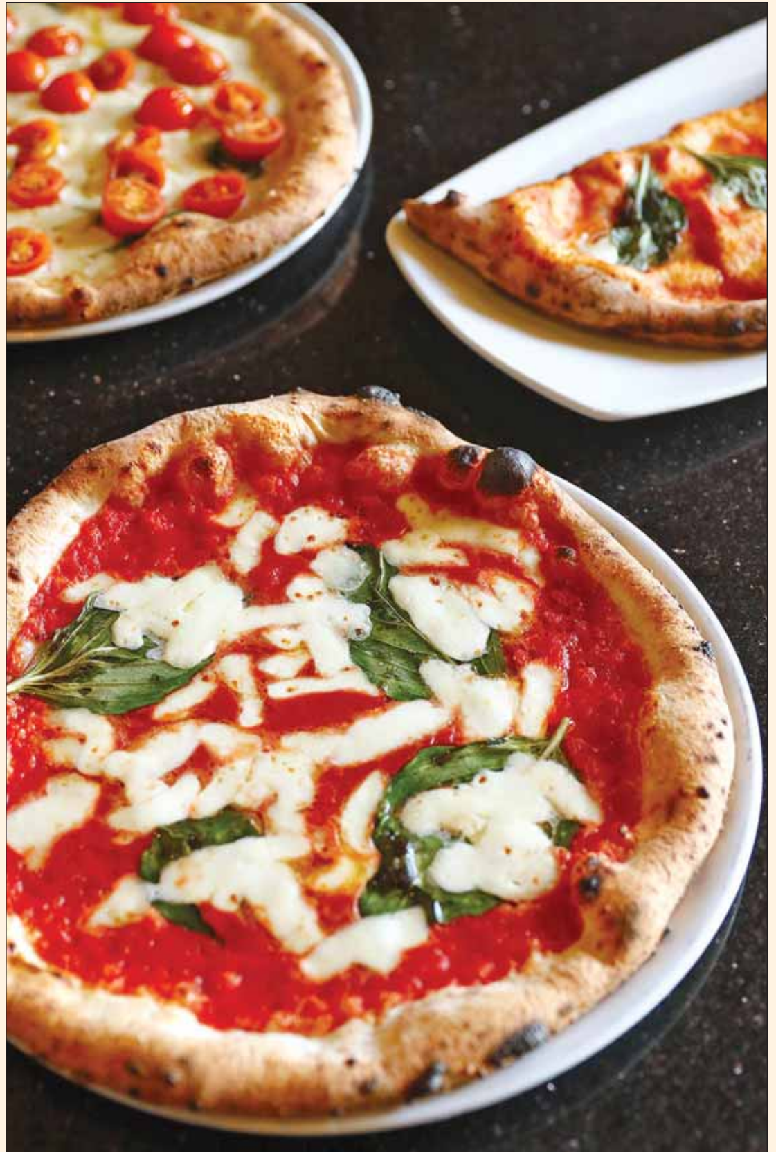
Napoletana Pizzeria's menu stays authentic to Naples' pizza-making traditions with its tomato-and-basil Margherita, classic calzone and cherry tomato-topped pizza alla checca.

Eleftheriadis only uses flour, water, salt and natural yeast to make his pizza dough. The