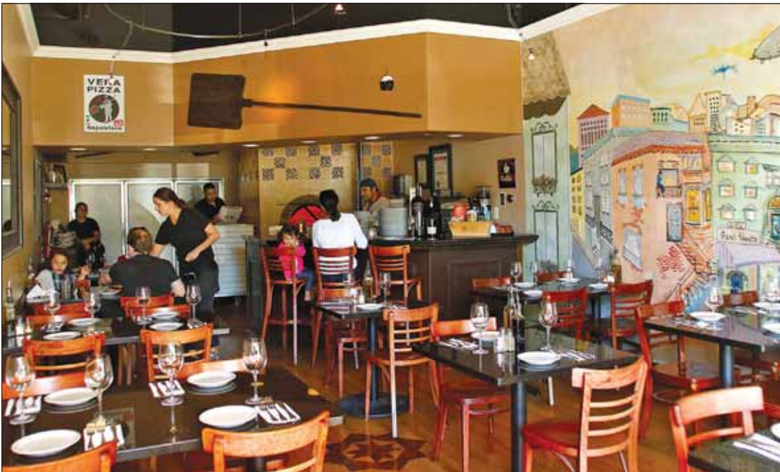
Diners arrive early to get seats at Napoletana Pizzeria in Mountain View on May 15.