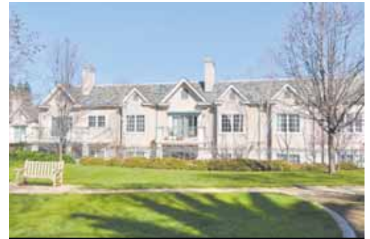
LOS ALTOS $1,860,000