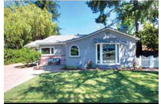
LOS ALTOS $2,298,000

2220 Old Page Mill Road | 2bd/2ba Tim Anderson | 650.209.1590