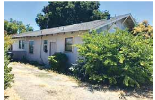
EAST PALO ALTO $710,000

310 Schroeder Street | 3bd/1ba Jackie Haugh | 415.990.0539