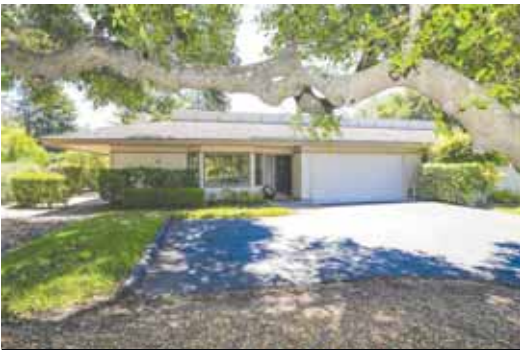
LOS ALTOS $2,265,000

11741 Par Avenue | 5bd/3ba Jeff Stricker | 650.823.8057