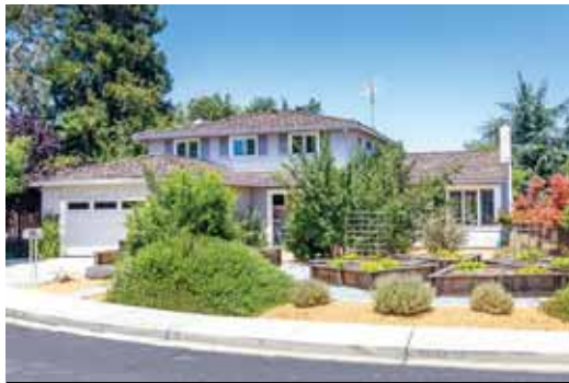
SANTA CLARA $1,990,000

15 Deep Well Lane | 2bd/2ba Patrice Horvath | 650.209.1602