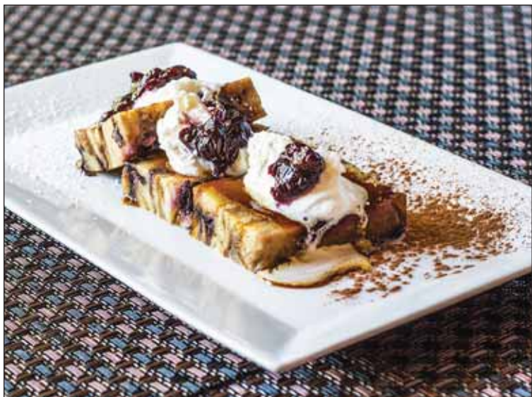
Above: The mango-raisin bread pudding is topped with whipped cream at Aly's on Main in Redwood City. Top: A salad of red and yellow beets is served with fennel and avocado.