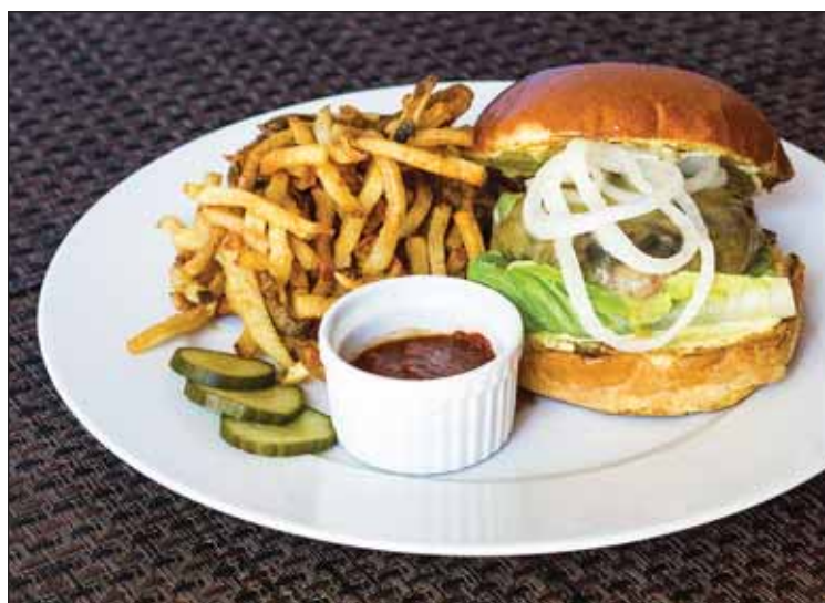
Grass-fed beef is ground in-house for Aly's on Main's cheeseburger, which is topped with sharp cheddar and onions.

270 Escuela Avenue, Mountain View (650) 289-5499 • avenidas.org/care