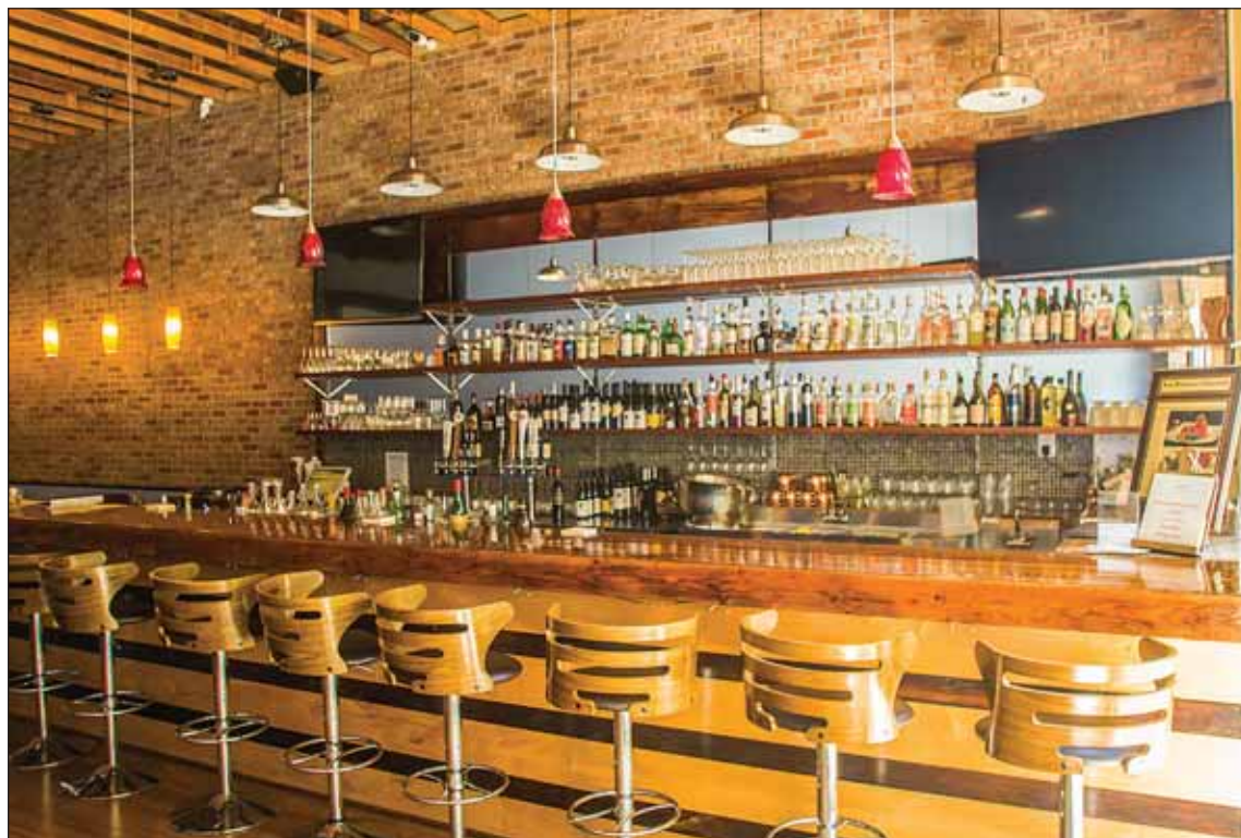
Left: Prosciutto-wrapped dates are stuffed with Cambozola cheese and drizzled with fig syrup at Aly's on Main. Right: A gleaming bar offers custom cocktails such as the Boulevardier, a bourbon-based Negroni.

slowly changes hues make the interior warm and appealing. The bar is especially attractive, with bottles displayed on mirrored shelves and arty-looking barstools illuminated by cobalt-blue lights. The effect is dampened somewhat by two large screens showing different sports channels. Both the scale of the TVs and the content choice feel at odds with the general welcoming vibe the restaurant strives to maintain.