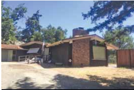
LOS ALTOS HILLS $2,395,000

1760 Larkellen Lane | 4bd/2.5ba Jeff Stricker | 650.941.1111