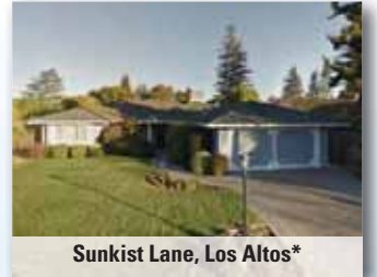
Sunkist Lane, Los Altos*