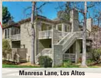
Manresa Lane, Los Altos