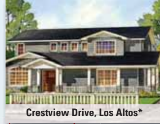
Crestview Drive, Los Altos*