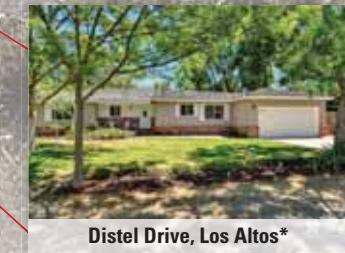
Distel Drive, Los Altos*