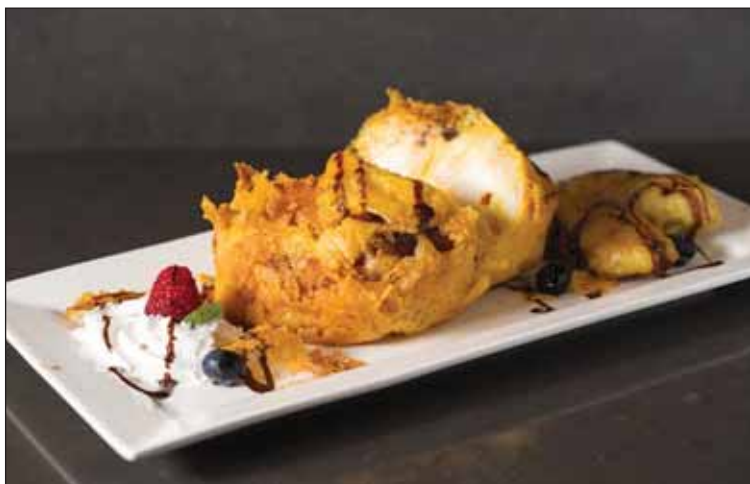
Deep-fried mango ice cream is served with a deep-fried banana and drizzled with chocolate syrup.

Email Ruth Schechter at ruths315@sbcglobal.net.