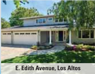
E. Edith Avenue, Los Altos