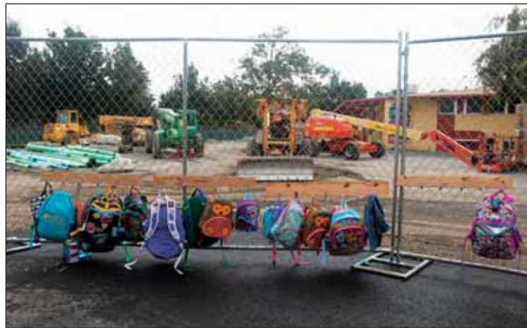
ANA SOFIA AMIEVA-WANG

Construction projects are becoming an increasingly common sight at local school campuses.