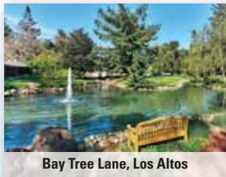
Bay Tree Lane, Los Altos