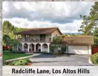
Radcliffe Lane, Los Altos Hills