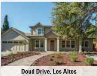
Doud Drive, Los Altos