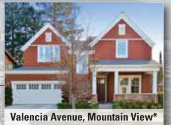
Valencia Avenue, Mountain View*