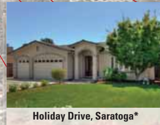
Holiday Drive, Saratoga*