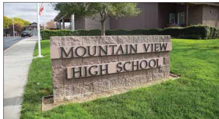
A brutal beating outside of the Mountain View Center for the Performing Arts in November led to the city's first homicide case in three years.