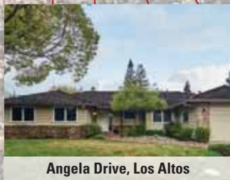
Angela Drive, Los Altos