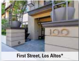
First Street, Los Altos*