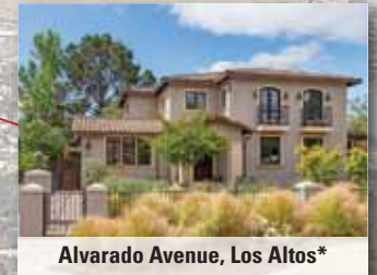
Alvarado Avenue, Los Altos*