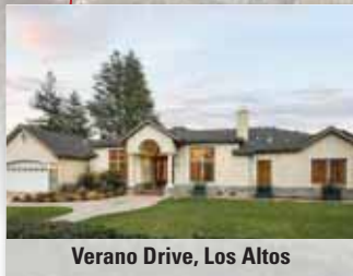
Verano Drive, Los Altos