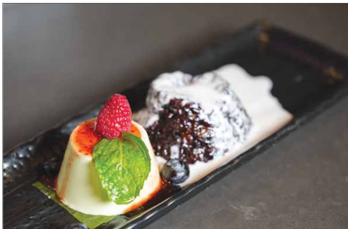
Black Pepper's pandan panna cotta is served with black sticky rice and coconut milk.