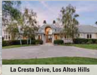
La Cresta Drive, Los Altos Hills