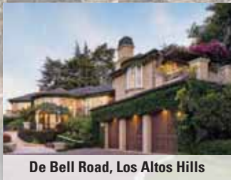
De Bell Road, Los Altos Hills