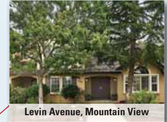
Levin Avenue, Mountain View