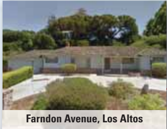
Farndon Avenue, Los Altos