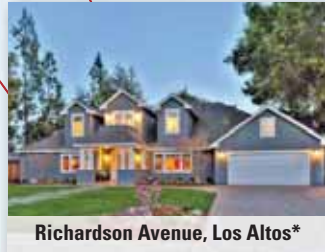
Richardson Avenue, Los Altos*