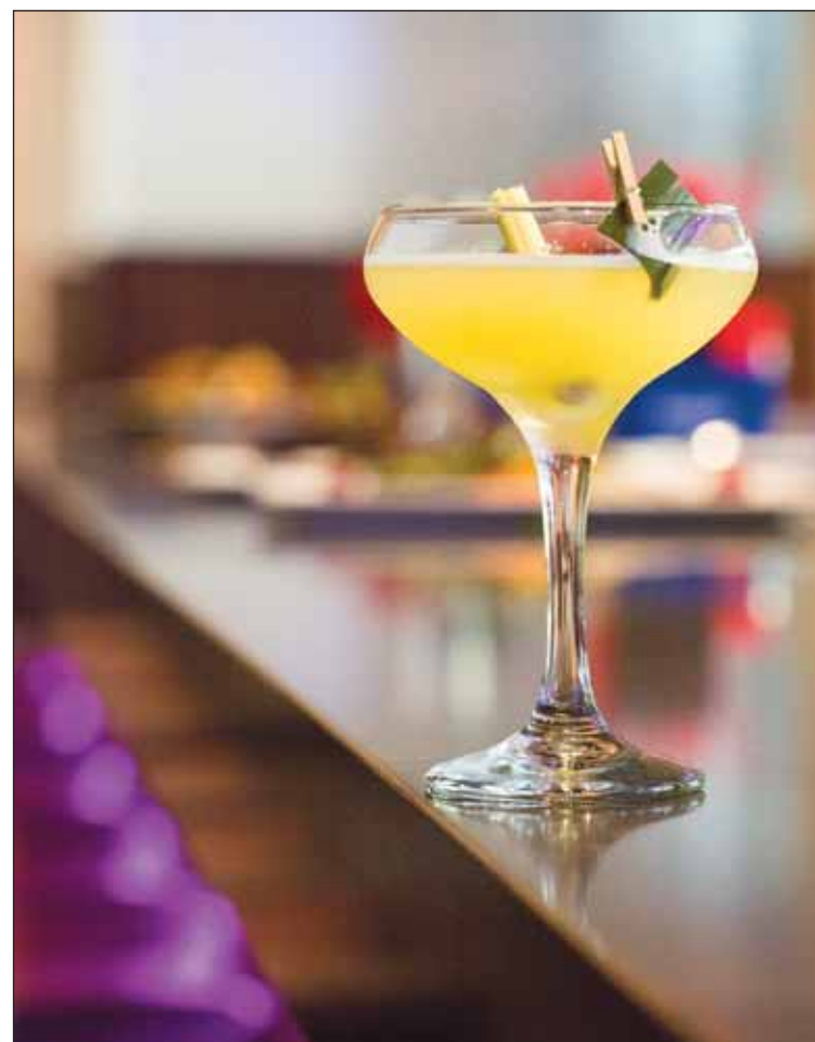
The lemongrass tea garden cocktail at Black Pepper.

just a hint of tang. Singapore-style black pepper eggplant and green beans ($15) is just one of several appealing vegetarian variations and is a terrific