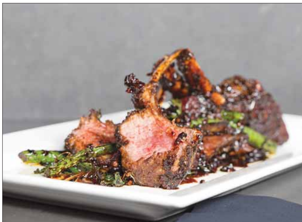
Above: The Singapore-style black pepper lamb chop at Black Pepper, a Malaysian restaurant in Menlo Park. Top: Ahi tuna salad is served with roasted shrimp and garnished with raspberries.