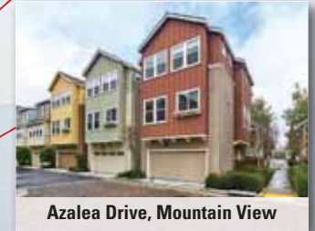
Azalea Drive, Mountain View