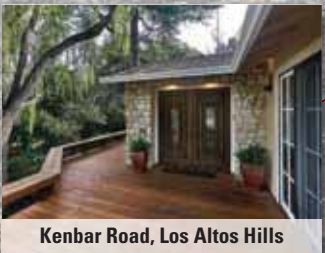
Kenbar Road, Los Altos Hills