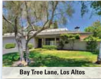
Bay Tree Lane, Los Altos