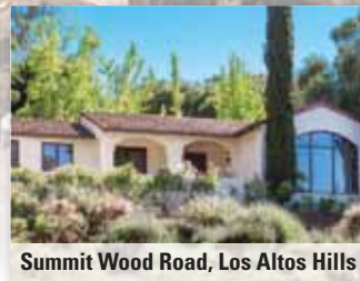
Summit Wood Road, Los Altos Hills