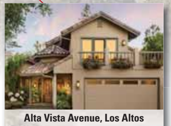
Alta Vista Avenue, Los Altos