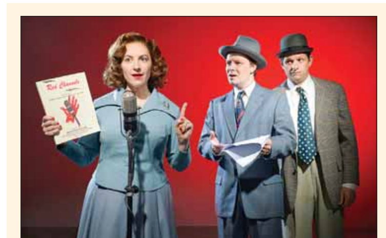
TheatreWorks Silicon Valley Presents 'FINKS' TheatreWorks Silicon Valley presents the California Premiere of "FINKS," a comic drama based on the true story of comedian/actor Jack Gilford. June 6-July 1, times vary. $40-$100. Mountain View Center for the Performing Arts, 500 Castro St., Mountain View. theatreworks.org/201718-season