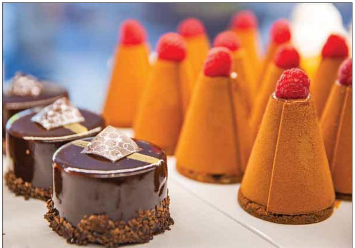
Desserts at Morsey's Farmhouse include a gluten-free chocolate marquise and conical servings of dulce de leche mousse topped with a raspberry.