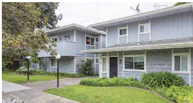
North Los Altos | 2/2 | $1,148,000

Marcie Soderquist 650.941.7040 CalRE #01193911