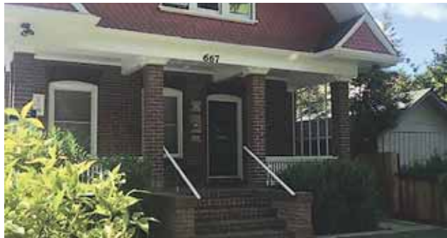
Downtown Palo Alto | 3/1.5 | $4,298,000 Zoned R1. Used as Professional or Medical office spaces.

Barbara Cannon 650.941.7040 CalRE #00992429