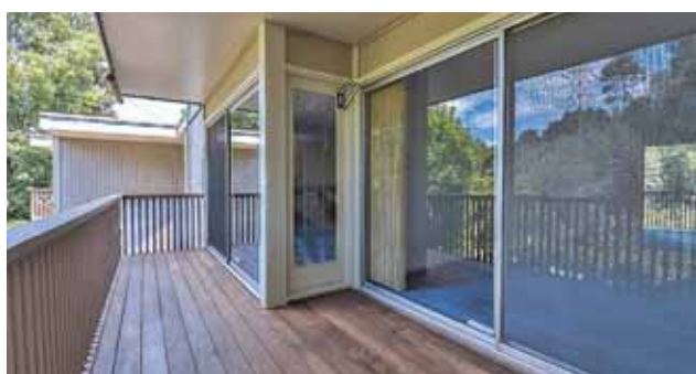
Mountain View | 2/1 | $749,000 | Sat/Sun 1:30 - 4:30 280 Easy Street #414 Convenient Location. Well maintained top floor unit. HOA$ 384, water, gas, garbage included

Cindy Mattison 650.941.7040 CalRE #01052018