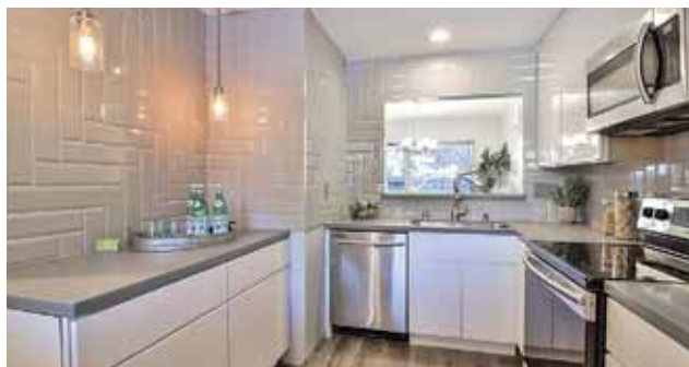
Cupertino | 4/2.5 | $1,399,000 Gorgeous Remodel has 4 bedrooms, 2.5 baths and 1409 sft of living space.

Kathryn Tomaino 650.941.7040 CalRE #00948257