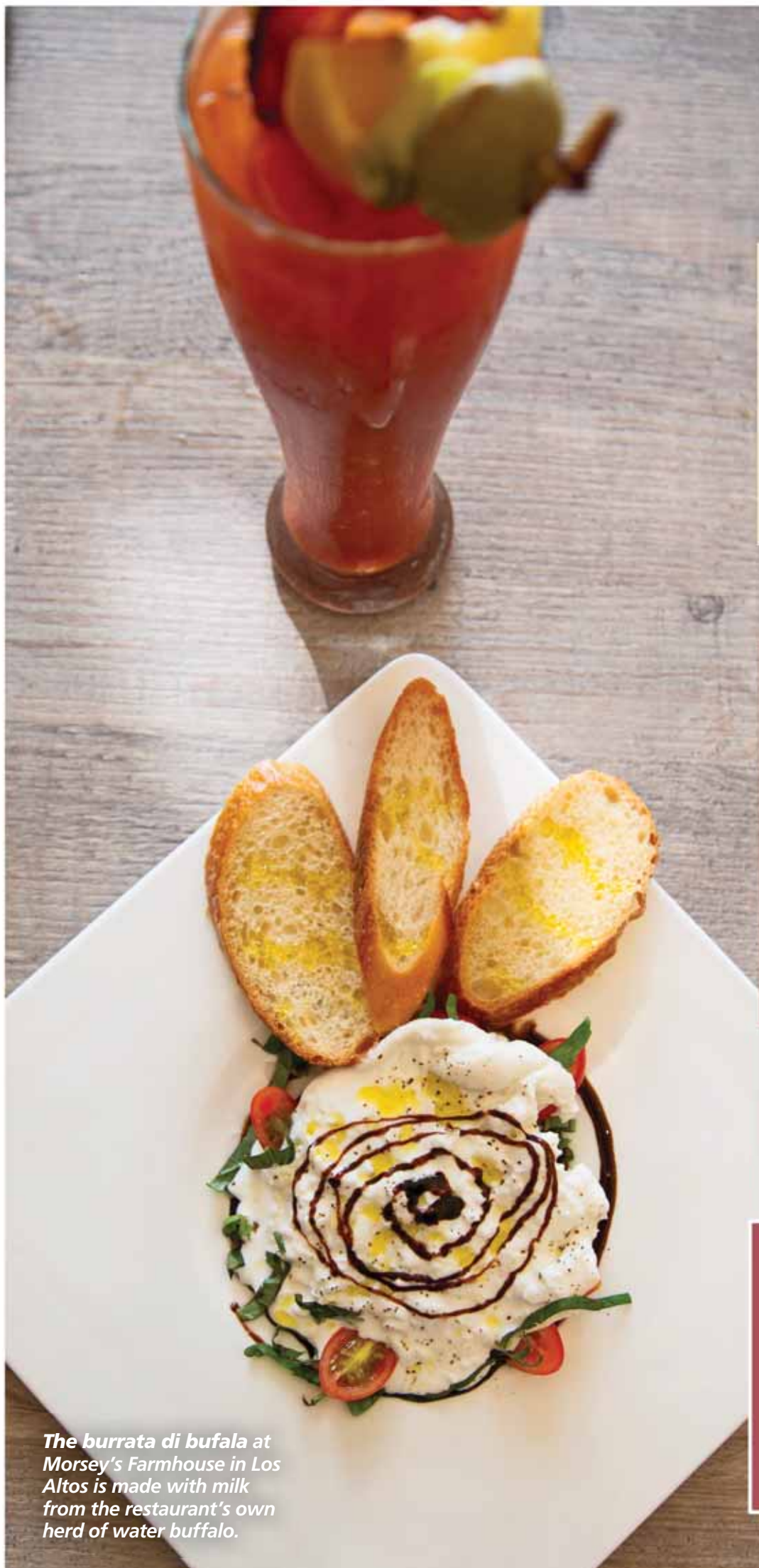
The burrata di bufala at Morsey's Farmhouse in Los Altos is made with milk from the restaurant's own herd of water buffalo.