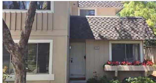
Cupertino | 3/2.5 | $1,448,000 Desirable end unit in choice location features separate living, family and dining rooms.

Catherine Qian 650.941.7040 CalRE #01276431