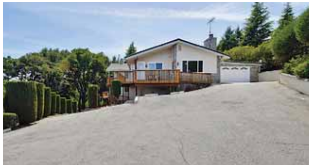
Cupertino | 4/3 | $2,980,000 1-acre, has 3,196 SQFT of living space with 5 bedrooms, and 4 full baths.

Barbara Cannon 650.941.7040 CalRE #00992429