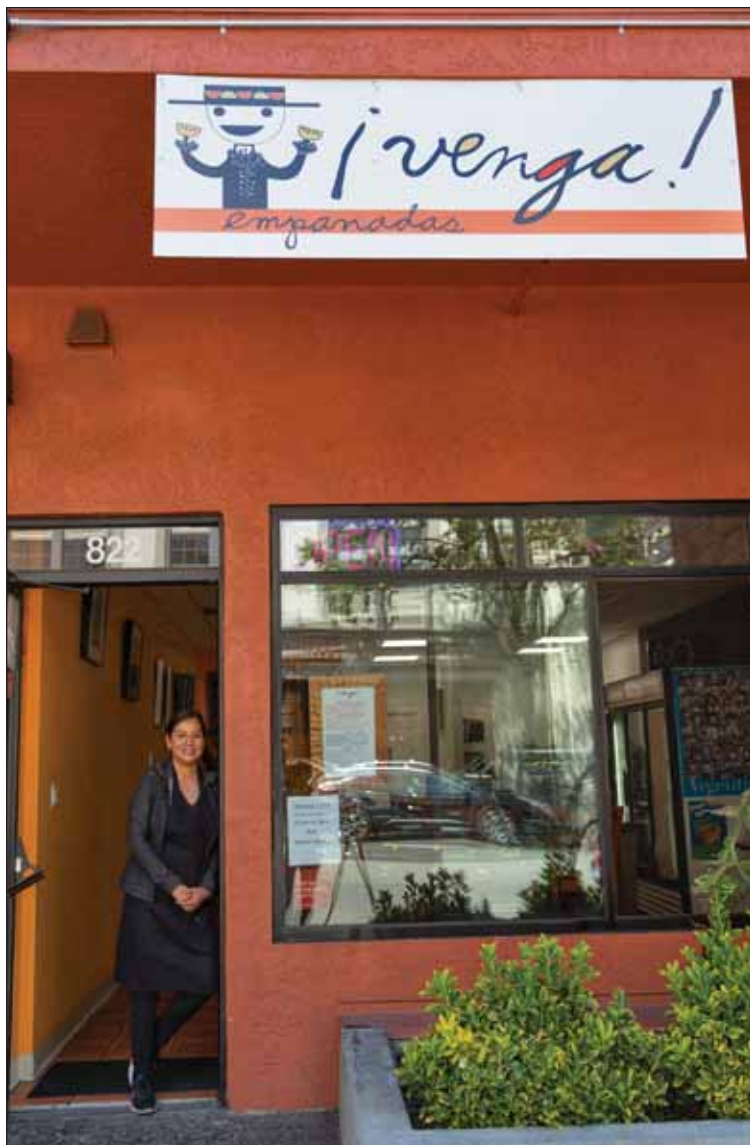
Venga Empanadas is located on Main Street in downtown Redwood City.