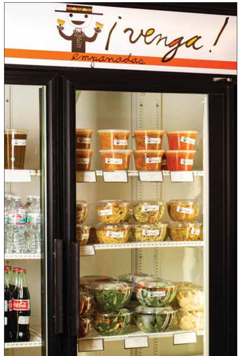
Grab-and-go items include salads and soups.