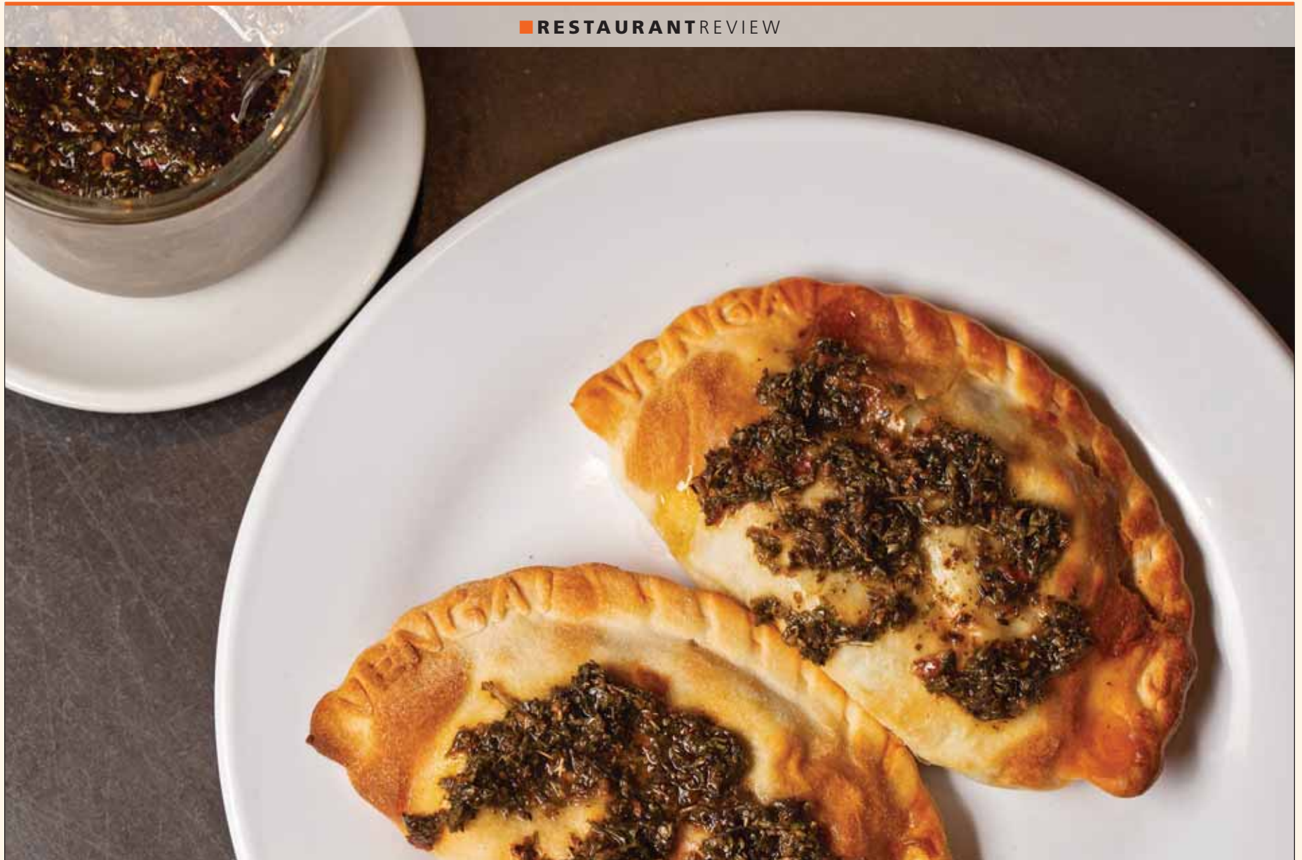
Empanadas of spinach and Argentinian beef are served with chimichuri sauce at Venga Empanadas in Redwood City.