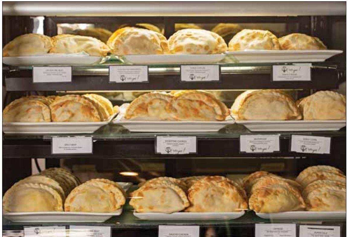
A display of vegetarian and meat-filled empanadas tempts diners at Venga.

Visit us at www.avenidas.org/care • Call us today at (650) 289-5499 to schedule a free visiting day!