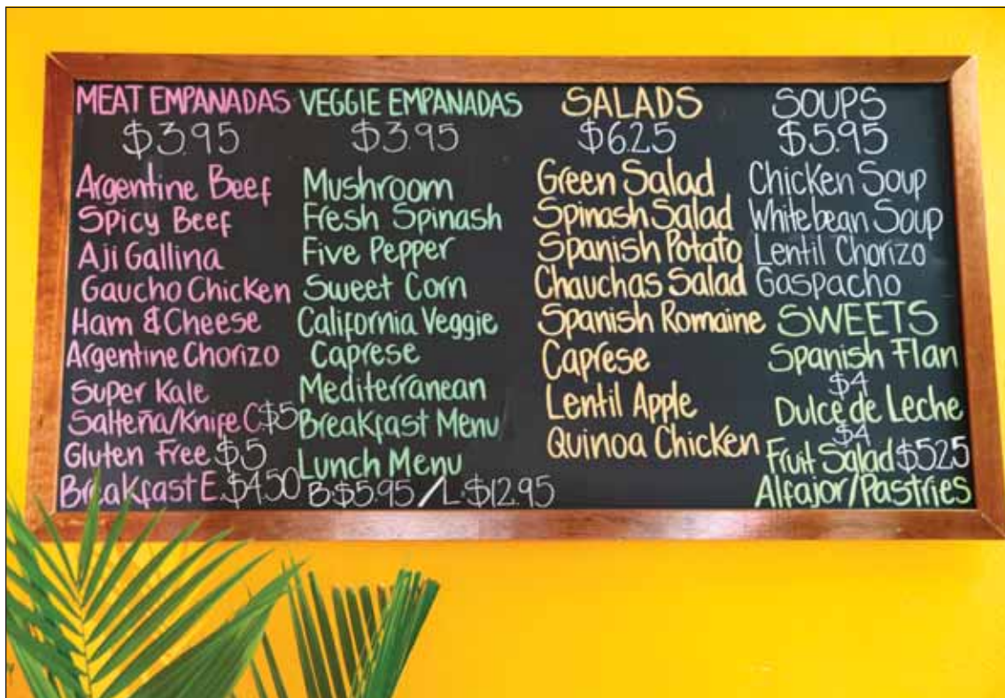
The most popular empanadas, which are not made on-site, may sell out toward the end of the day.

My favorite empanadas at the new Redwood City outpost were the Argentine beef ($3.95) made with beef, onions, red bell pepper and hard-boiled egg. The savory aji gallina ($3.95) with chicken, onions, yellow bell pepper, tomatoes, parsley, cumin, saffron, chile flakes and cayenne pepper was spicy but not hot.