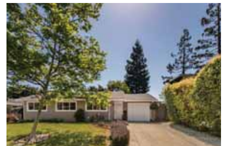
1013 Karen Way Mountain View Listed for: $1,998,000 Sold for: $2,620,000