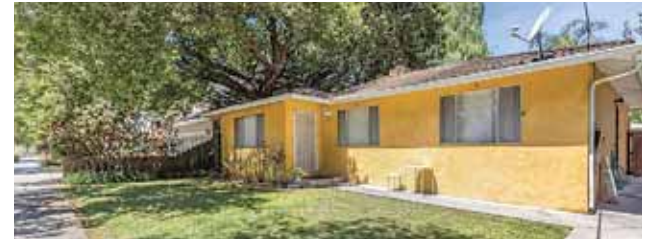
Downtown Mountain View | $3,200,000 Dwells on a beautiful street w/ mature trees & period homes! *Do not disturb occupants*