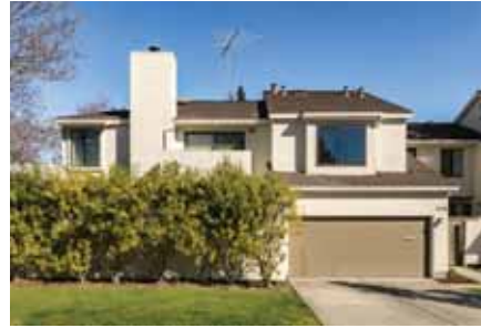
1918 Hackett Avenue Mountain View Listed for: $1,298,000 Sold for: $1,620,000