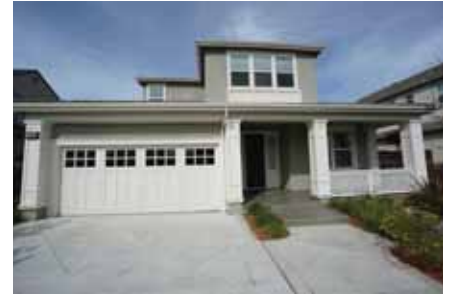
Marigold Court Mountain View Listed for: $2,988,000 Sold for: $3,390,000