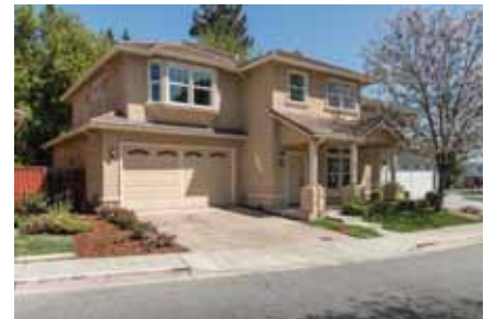
290 Skyview Court Mountain View Listed for: $1,998,000 Sold for: $2,150,000