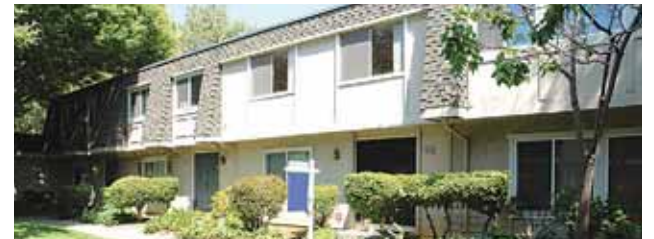
Santa Teresa | 3/2.5 | $747,000 3bed/2.5 bath appx. 1656 SqFt townhouse near foothill trails of Santa Teresa Golf Club.