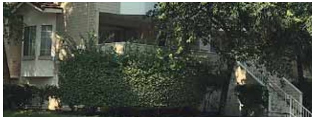
San Jose | 3/2.5 | $1,198,000 | Sat/Sun 1:30 - 4:30 701 Hibiscus Place This 3 bedroom, 2.5 bath townhome is in the sought after Moreland school district.

Dorothy Gurwith 650.325.6161 CalBRE #01248679