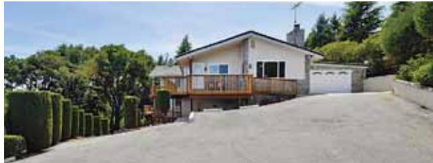
Cupertino | 5/4 | $2,880,000 1-acre, has 3,196 SQFT of living space with 5 bedrooms, and 4 full baths.

Kim Copher 650.941.7040 CalBRE #01423875