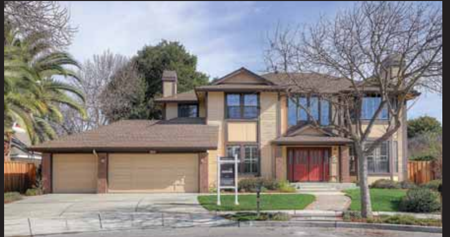
109 STRATFORD COURT, MOUNTAIN VIEW