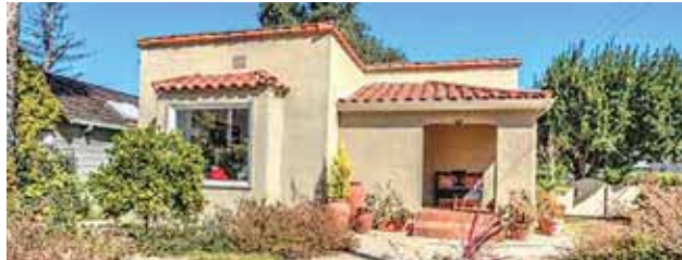
Los Altos | 3/2 | $3,400,000 On a quiet tree lined street this recently remodeled single story house near downtown LA.

Barbara Cannon 650.941.7040 CalBRE #00992429