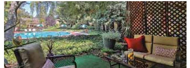
Mountain View | 2/2 | $1,100,000 | Sat/Sun 1:30 - 4:30 505 Cypress Point Drive #214 2bed/2bath condo with updated kitchen & baths. Pool, tennis courts, close to vibrant Castro Street.

Terrie Masuda 650.941.7040 CalBRE #00951976