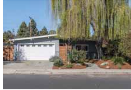
680 Emily Drive Mountain View Listed for: $1,298,000 Sold for: $1,800,000