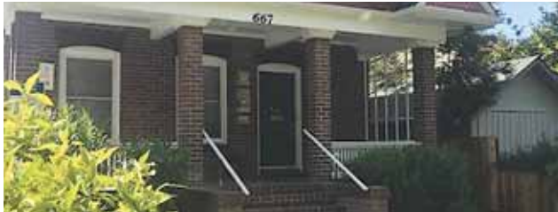
Downtown Palo Alto | 3/1.5 | $4,298,000 Zoned R1. Used as Professional or Medical office spaces.

Barbara Cannon 650.941.7040 CalBRE #00992429