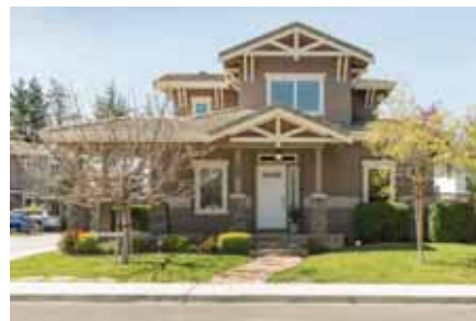
284 Monroe Drive Mountain View Listed for: $2,298,000 Sold for: $2,780,000