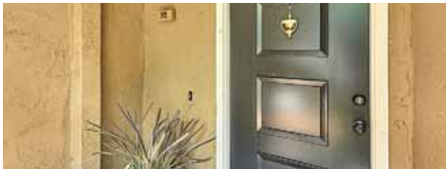
Los Gatos | 2/2 | $888,000 Beautiful. Designer Updates. A+ Light & Location. Mature lush green landscape. Private deck.

Nancy Goldcamp 650.325.6161 CalBRE #00787851