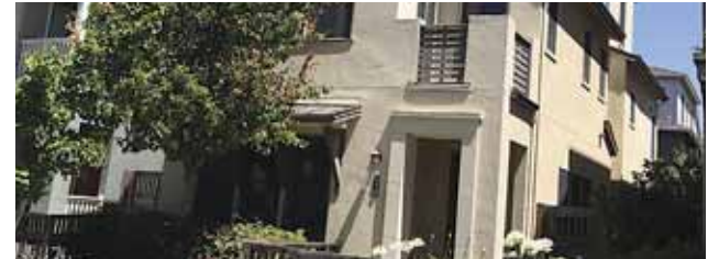
Palo Alto | 4/3.5 | $2,498,000 8 years new! 4 BD/3.5BA/approx 2400 SF

Catherine Qian 650.941.7040 CalBRE #01276431