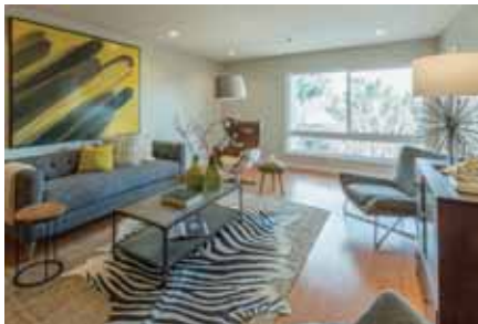
49 Showers Drive #J316 Mountain View Listed for: $1,198,000 Sold for: $1,350,000