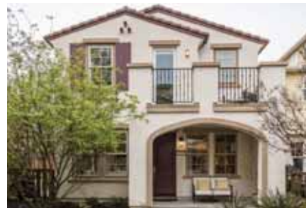
134 Avellino Way Mountain View Listed for: $1,998,000 Sold for: $2,580,000