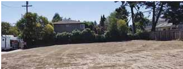
Mountain View | $2,280,000 This approx. 10,350 square foot lot on Victor Way is on the Los Altos side of El Camino