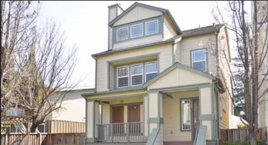
187 HAMWOOD TERRACE, MOUNTAIN VIEW