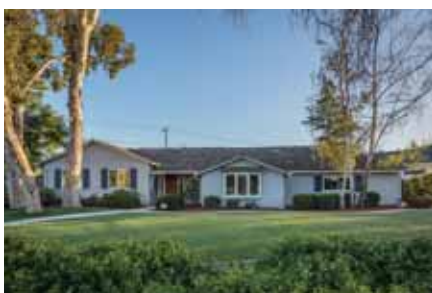
1163 Barbara Avenue Mountain View Listed for: $2,888,000 Sold for: $2,888,000