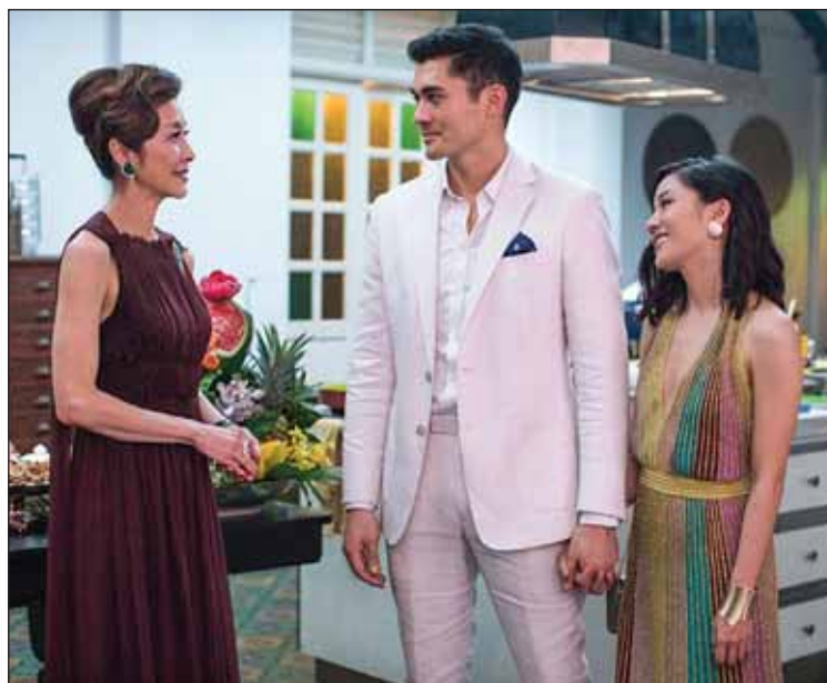
"Crazy Rich Asians" stars Michelle Yeoh, Henry Golding and Constance Wu.

It's a stretch, of course, that Nick has kept this secret as long as he has, but the contrivance allows the audience to join Rachel on her trip down the rabbit hole to a new world. In Singapore, Rachel feels the hard glare of Nick's mother Eleanor Sung-Young (Michelle Yeoh), who quickly judges Rachel a liability ("All Americans think about is their own happiness"). Meanwhile, Rachel faces toxic gossip and backbiting from the local contingent of mean girls while accepting moral support from friends old and new. At every turn, the elephant in the room is the "crazy" richness of