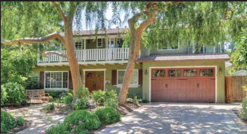
140 CHATHAM WAY, MOUNTAIN VIEW