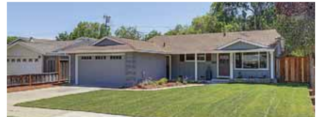
San Jose | 3/2 | $1,399,000 Just-remodeled home in best SJ hood, hwd floors, close to Hwy 85/280. Charm! Top schools!

Ulli Rieckmann-Fechner 650.941.7040 CalBRE #01831140