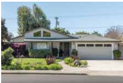
1614 Montalto Drive Mountain View Listed for: $2,298,000 Sold for: $2,750,000