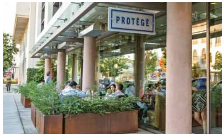
Above: The lounge offers outdoor seating on California Avenue in Palo Alto. Top: Protégé's house cocktails include, from left, the "smoke screen" made with mezcal and amaro, an Old Fashioned, and the "pomelo daisy flower" made with tequila blanco, pamplemousse and guava.