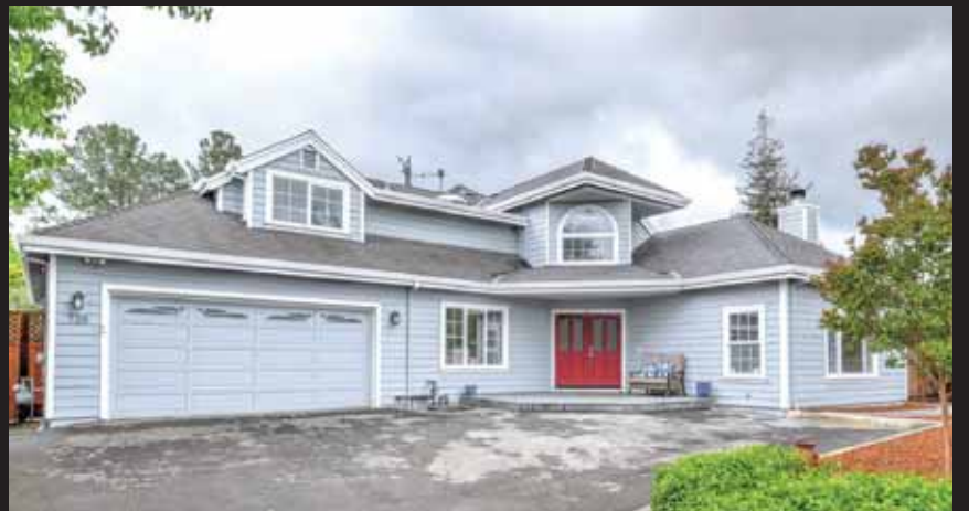
735 SLEEPER AVE, MOUNTAIN VIEW