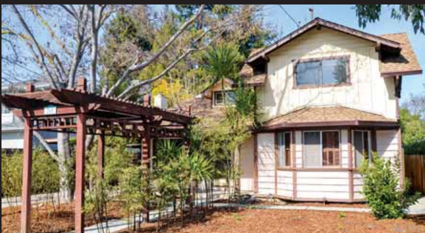
262 MARTENS AVENUE, MOUNTAIN VIEW

CALL US TODAY FOR YOUR FREE HOME EVALUATION