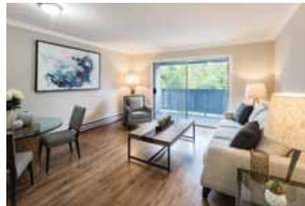
650 Alamo Court #13 Mountain View Listed for: $598,000 Sold for: $650,000