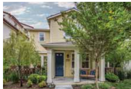
136 Avellino Way Mountain View Listed for: $1,998,000 Sold for: $2,553,000