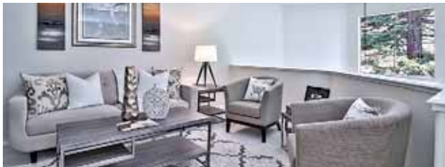
Sunnyvale | 3/2 | $1,325,000 Sat/Sun 1:30 - 4:30 991 Asilomar Terrace #6 Rarely available loft model floorplan TH, end unit in a desirable & well located complex.

Pat McNulty 650.941.7040 CalBRE #01714085