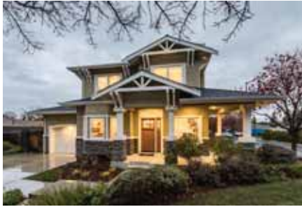
86 Murlagan Avenue Mountain View Listed for: $1,698,000 Sold for: $2,425,000