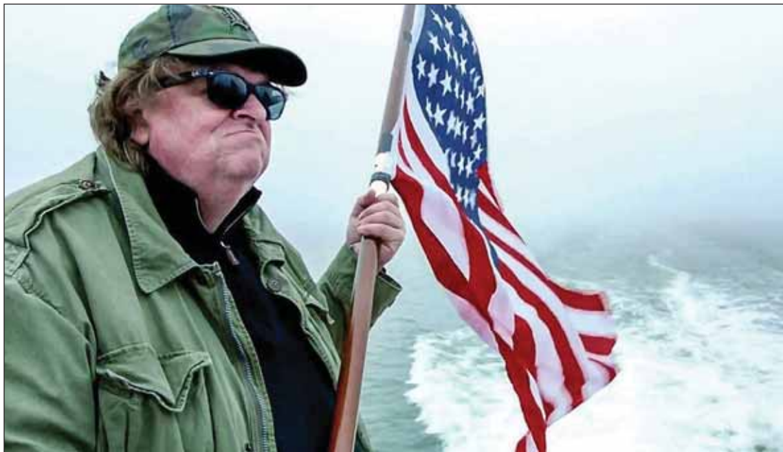
Michael Moore rallies progressives in "Fahrenheit 11/9."