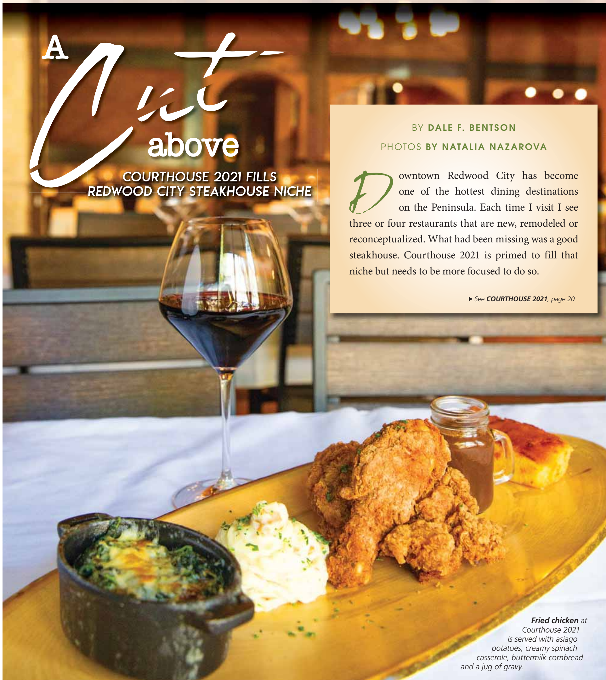
Fried chicken at Courthouse 2021 is served with asiago potatoes, creamy spinach casserole, buttermilk cornbread and a jug of gravy.