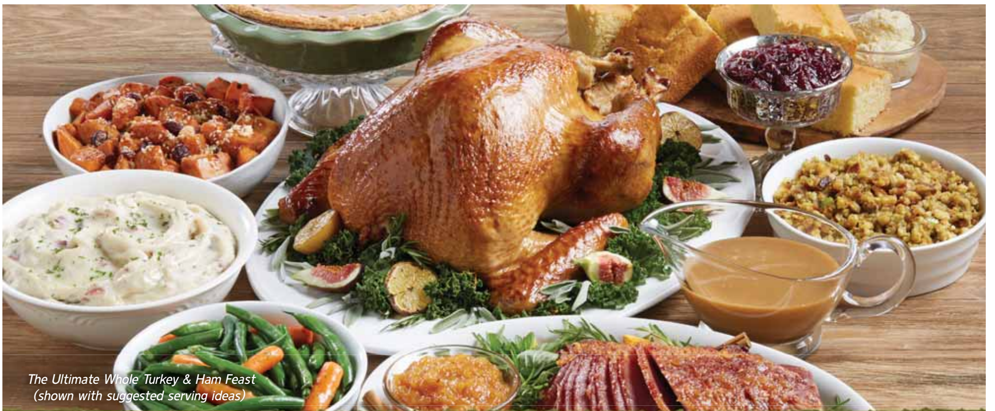
The Ultimate Whole Turkey & Ham Feast (shown with suggested serving ideas)

“I really appreciated the strong connection to values [Kehillah] fostered. I studied hard with friends, who also studied hard, and was supported to be entrepreneurial by teachers.”