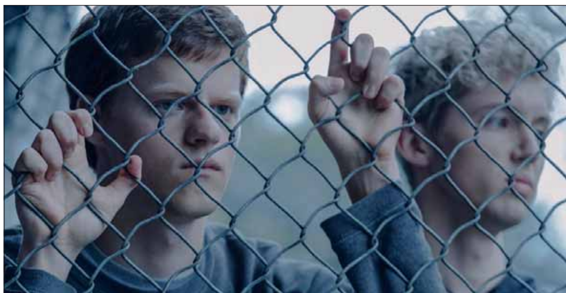
UNERASED FILMS INC.

What follows is an incident-driven narrative that hits its marks in showing the absurdities and horrors of such programs while not delving very deeply into the psychology of its characters. Edgerton's script repeatedly raises questions (about what's going through the characters' minds or the complexities of their struggles) that it doesn't