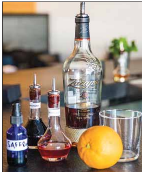
Ron Zacapa rum is mixed with Angostura and Peychaud’s bitters, misted with a saffron tincture and garnished with an orange twist in the “Old Greg.”