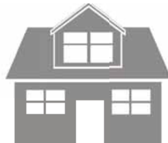
106 N. Springer Road Los Altos 5 br/5 ba