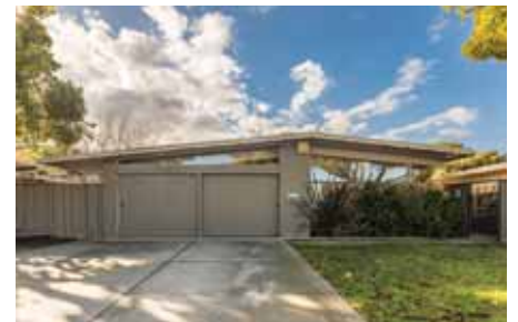
2154 Saint Francis Drive Palo Alto 3 br/2 ba

Buy Direct With DeLeon Buyer Team and We Will Waive 100% of the Buyer's Side Commission for Any DeLeon Listings.