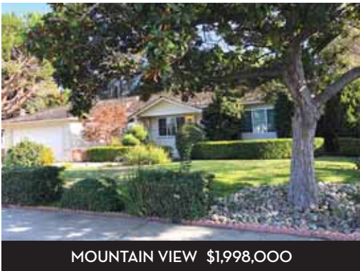
MOUNTAIN VIEW $1,998,000

910 San Marcos Circle | 4bd/2ba Jerylann Mateo | 650.743.7895 License # 01362250