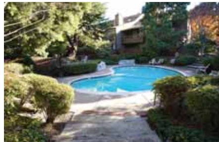
2040 W. Middlefield Rd, Unit 20 Mountain View 3 br/3 ba