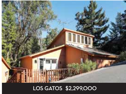
LOS GATOS $2,299,000

1032 Dartmouth | 5bd/2ba Jackie Haugh | 650.209.1570 License # 01422242