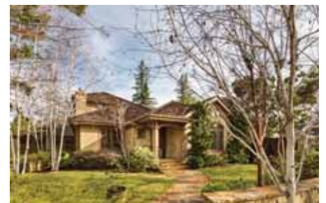
2281 Byron Street Palo Alto 5 br/5.5 ba