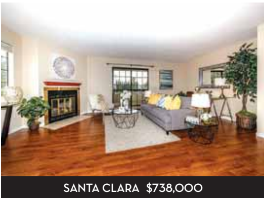
SANTA CLARA $738,000

6411 Canterbury Court | 3bd/2ba Lynn North | 650.209.1562 License # 01490039