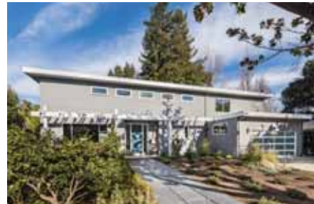
1087 Fife Avenue Palo Alto 5 br/2.5 ba, $3,988,000