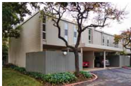
3281 Benton Street Santa Clara 4 br/2.5 ba, $898,000