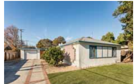
3233 Greer Road Palo Alto 3 br/1 ba, $2,288,000