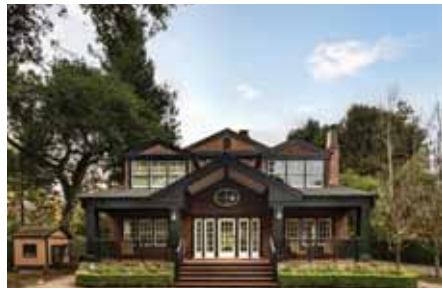
60 Winchester Drive Atherton 6 br/4 ba, $7,988,000