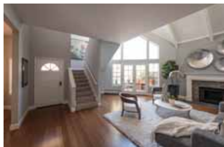
437 College Avenue Palo Alto 4 br/4 ba