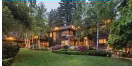
370 Mountain Home Court Woodside 4 br/5.5 ba, $17,988,000