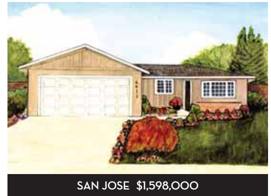
SAN JOSE $1,598,000

1027 Azalea Drive | 4bd/2ba Tori Atwell | 650.996.0123 License # 00927794