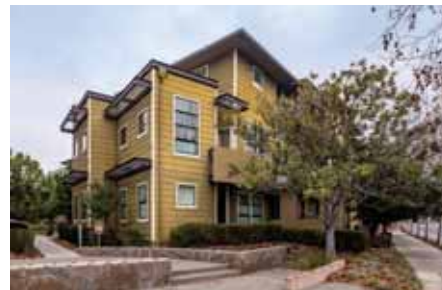
4238 Rickeys Way, Unit W Palo Alto 3 br/3 ba