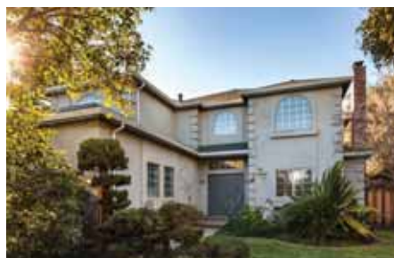
3880 Alameda de las Pulgas Menlo Park 6 br/4 ba, $3,488,000