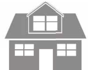
438 King Street Redwood City 3 br/3 ba, $1,599,000

Buy Direct With DeLeon Buyer Team and We Will Waive 100% of the Buyer's Side Commission for Any DeLeon Listings.