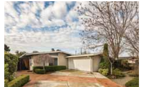
1262 Socorro Avenue Sunnyvale 3 br/2 ba, $1,298,000