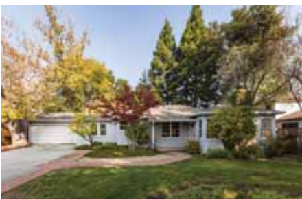
108 Durham Street Menlo Park 3 br/2 ba