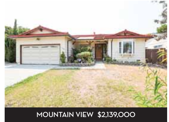
MOUNTAIN VIEW $2,139,000

178 College Avenue | 4bd/3ba Jerylann Mateo | 650.209.1601 License # 01362250