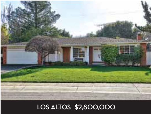
LOS ALTOS $2,800,000

1032 Dartmouth | 5bd/2ba Jackie Haugh | 650.209.1570 License # 01422242