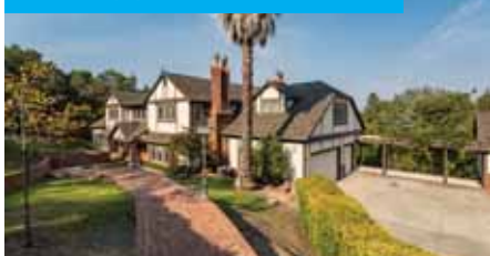
460 Las Pulgas Drive Woodside 6 br/7.5 ba, $5,988,000