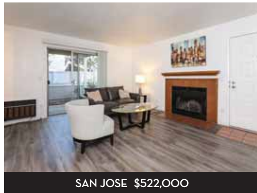
SAN JOSE $522,000

880 N Winchester Boulevard #207 | 2bd/2ba Tori Atwell | 650.996.0123 License # 00927794