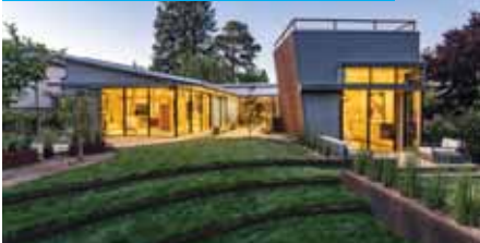
417 Seneca Street Palo Alto 6 br/4.5 ba, $7,788,000