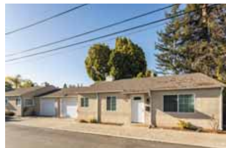
717 & 723 Ellsworth Place Palo Alto 4 br/2 ba, $2,488,000