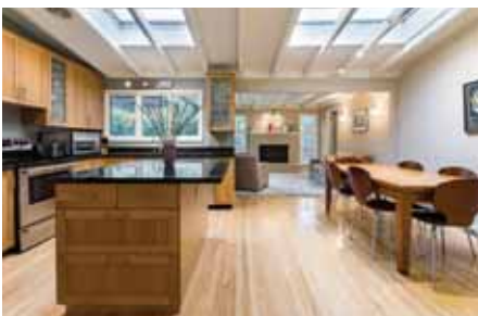
3632 Arbutus Avenue Palo Alto 4 br/2 ba, $2,998,000