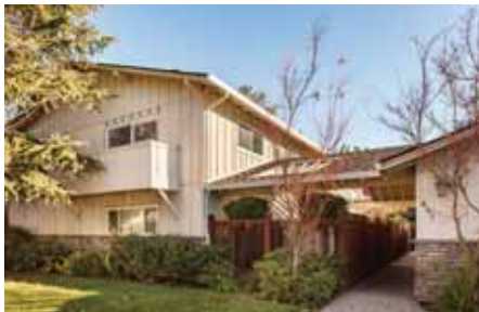
487 Tyndall Steet, Unit 5 Los Altos 2 br/1 ba, $998,000