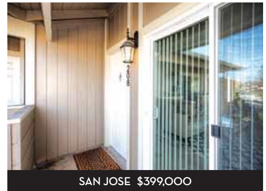
SAN JOSE $399,000

1063 Tekman Drive | 2bd/2ba Dottie & Hayward Monroe | 650.208.2500 License # 00594704 | 00602790