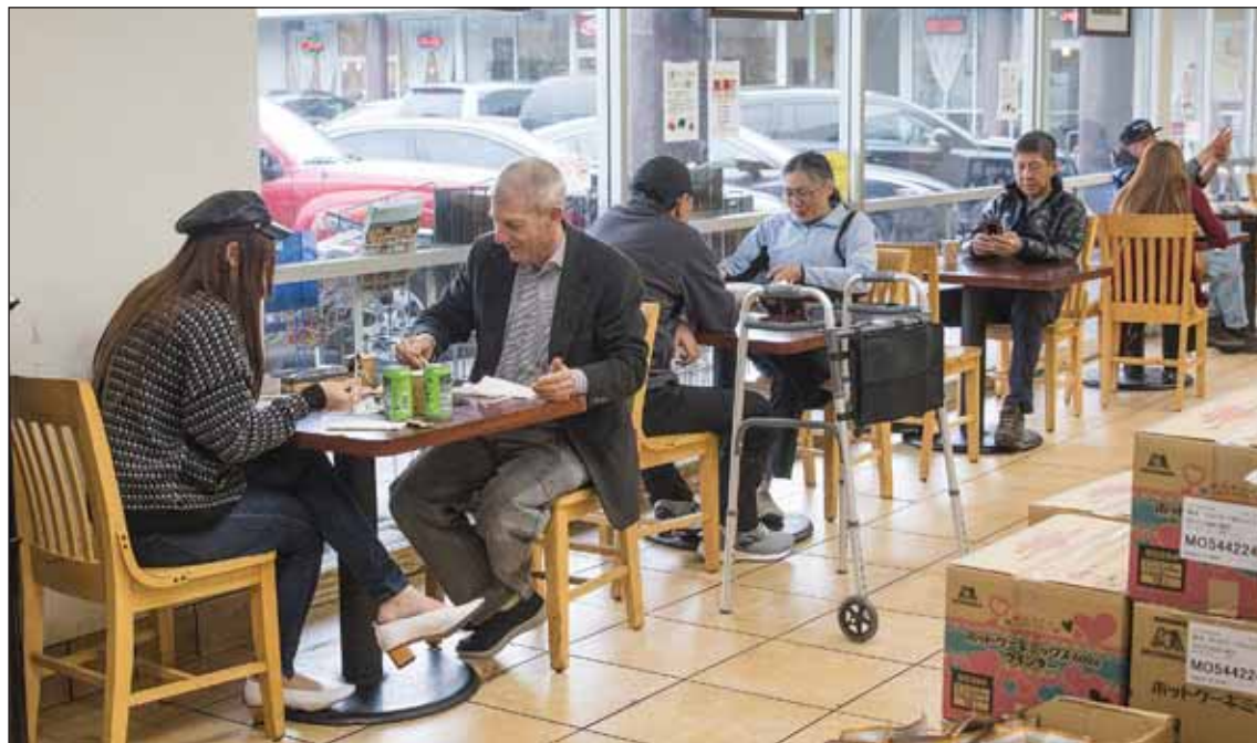
The Mountain View store offers tables for eating Nijiya Deli's takeout dishes.