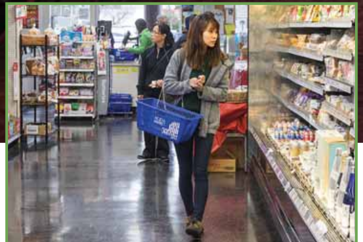
Above: Nijiya Market's shelves are stuffed with imported Japanese items. Top: The Mountain View store's deli sells hot bowls of ramen with rich broth, thin slices of pork and a boiled egg.

favorite products from Japan. He realized the potential of selling the imported goods and opened the first Nijiya Market in San Diego in 1986. "Niji" means rainbow and "ya" means store in Japanese. The store's rainbow icon represents a bridge between Japan and America, according to