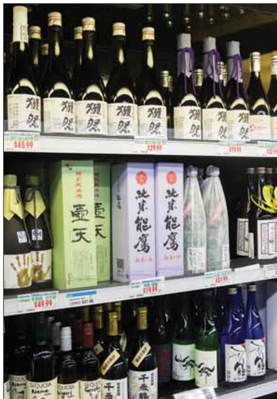
An assortment of sake lines the shelves at Nijiya Market in Mountain View.