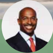
VAN JONES April 23

Lectures take place at the Mountain View Center for the Performing Arts.