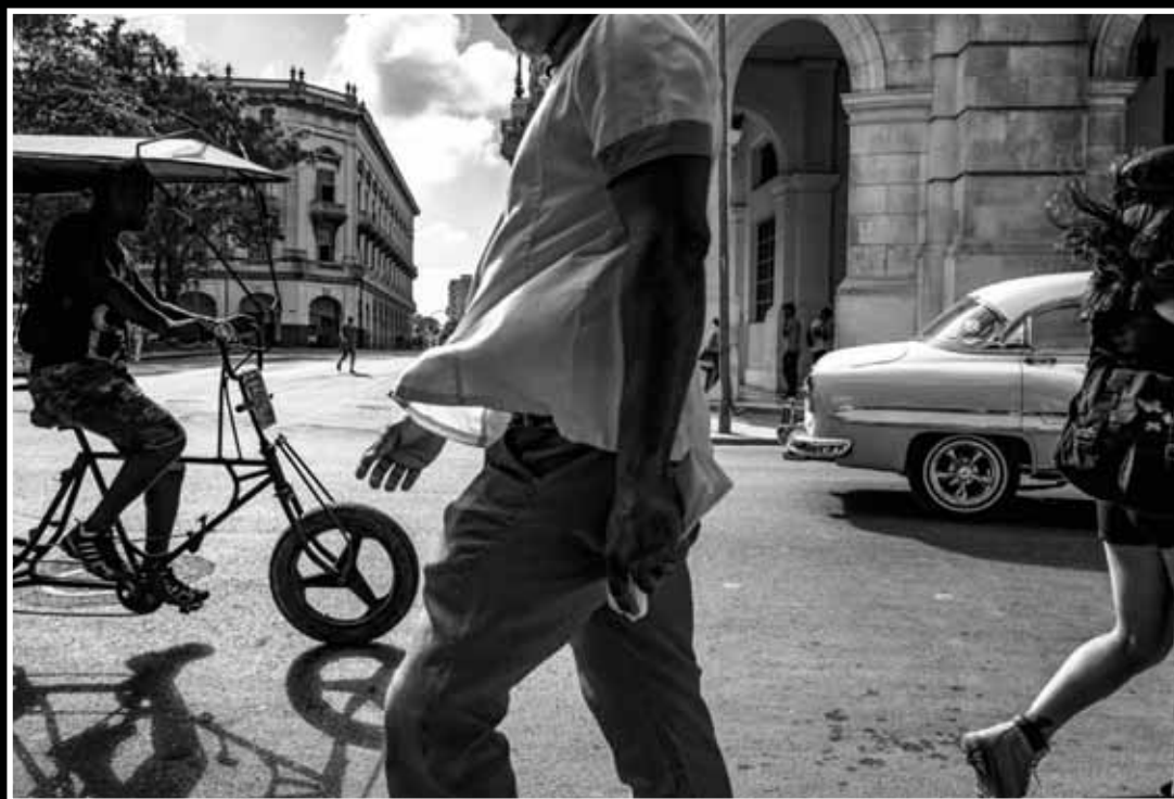
"Beautiful Chaos" by Dan Fenstermacher 2018 Best In Show and Travel Winner

The Mountain View Voice (USPS 2560) is published every Friday by Embarcadero Media, 450 Cambridge Ave, Palo Alto CA 94306 (650) 964-6300. Periodicals Postage Paid at Palo Alto CA and additional mailing offices. The Mountain View Voice is mailed free upon request to homes and apartments in Mountain View. Subscription rate of $60 per year. POSTMASTER: Send address changes to Mountain View Voice, 450 Cambridge Ave, Palo Alto, CA 94306.