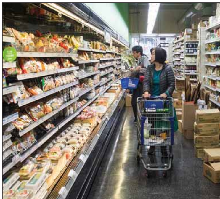
Shoppers browse Nijiya Market's selection of noodles and tofu.