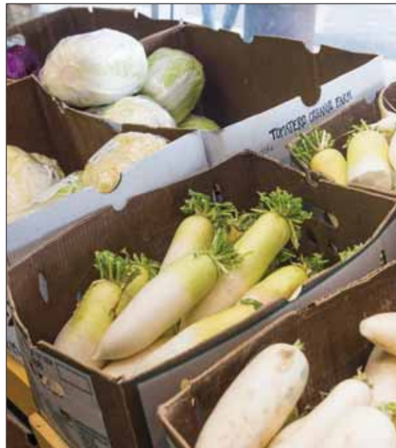
The produce section includes fruits and vegetables from Nijiya Farm in Southern California.