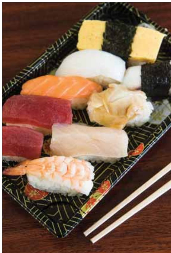
A takeout nigiri sushi platter offers ebi, tuna, salmon, squid, yellowfin, octopus and tamago.